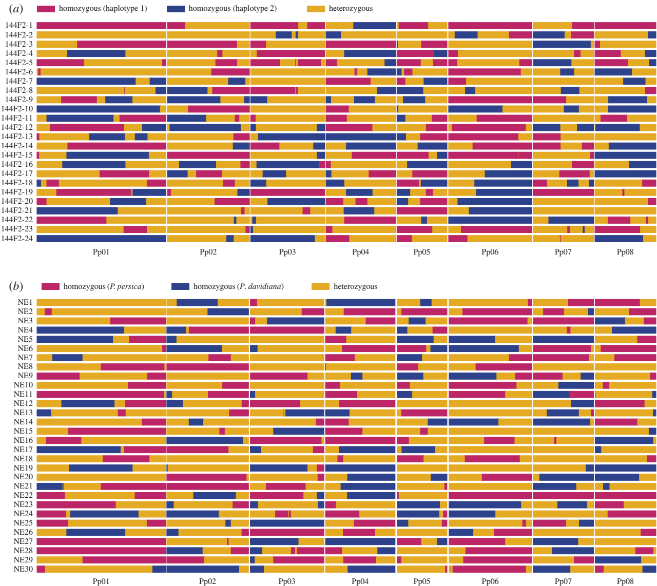
Figure 2. Graphical representation of CO recombinants. (a) Intraspecific ( P. persica ) F 2 samples, the homozygous genotype was choosing by random for each chromosome; (b) interspecific F 2 samples, the red haplotypes were derived from P. persica while the blue haplotypes were derived from its wild ancestor P. davidiana .

material, table S5) with a combined span of approximately 19-Mbp and 14 CO coldspots (10 000 randomizations, p < 0.05 ; electronic supplementary material, table S6), with a combined length of 53.8 Mbp. In other words, approximately 29% of CO events are clustered within approximately 8.6% of the entire genome (electronic supplementary material, table S5), and approximately 23.9% of the genome is devoid of the CO events (electronic supplementary material, table S6). The average recombination rate in hotspot regions ( 8.04 \text{ cM Mb}^{-1} ) is about 16.8-fold higher than that in the cold-spot regions ( 0.48 \text{ cM Mb}^{-1} ; t -test, p = 1.58 \times 10^{-17} ). Gene ontology analysis reveals a slight enrichment in serine-type endopeptidase activity under molecular function near hotspots (electronic supplementary material, figure S4), while coldspots are enriched for cysteine-type peptidase activity or other various binding activities, and most genes were related to the macromolecule metabolic process (electronic supplementary material, figure S5).