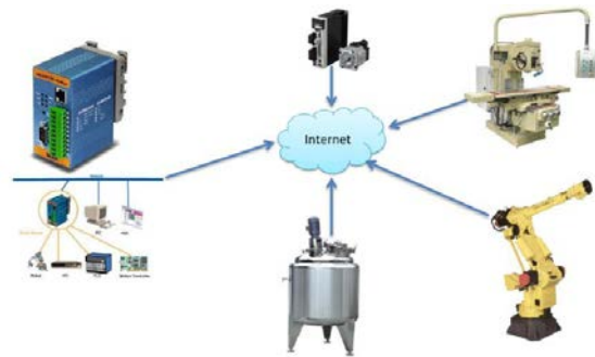
Fig. 1. Abstract idea of the Industrial Internet of Things.

and assembly line components, chemical mixing tanks, engines, healthcare devices such as insulin and infusion pumps, and even planes, trains, and automobiles. Indeed, it is a vast spectrum of devices.