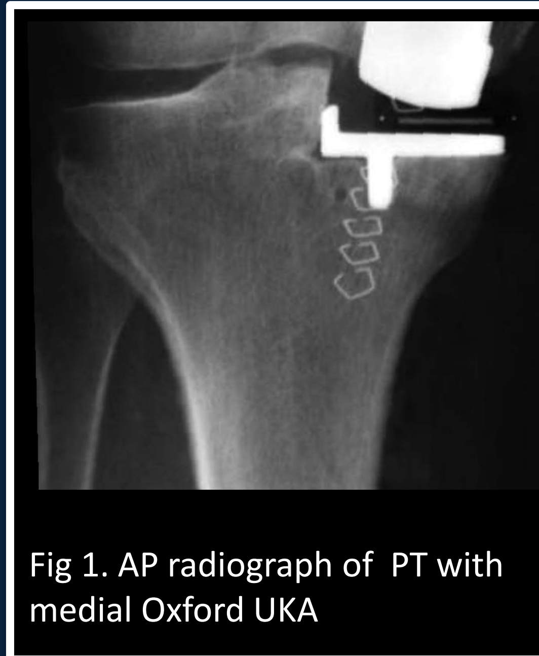
Fig 1. AP radiograph of PT with medial Oxford UKA

The Oxford Unicompartmental knee arthroplasty (UKA) is indicated in patients with anteromedial osteoarthritis. Although the Oxford UKA preserves knee kinematics and function more than total knee replacement designs, outcome is variable with comparatively high revision rates reported. Proximal tibial (PT) shape shows considerable natural variation; however, it is unknown whether PT morphology has any impact on the functional outcome of the Oxford UKA.