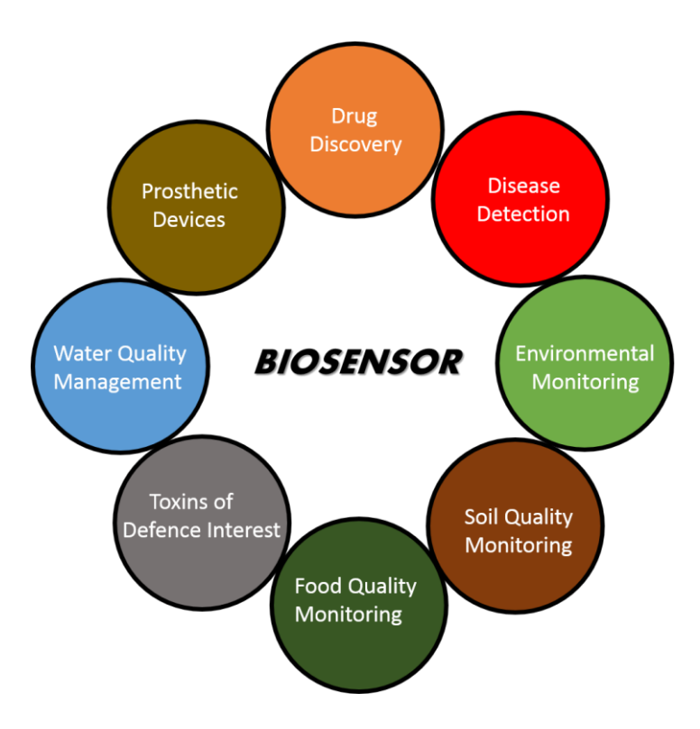
Figure 2 Major areas of applications for biosensors.