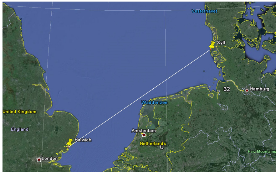
Figure 1. Loran-C propagation path between Sylt and Harwich.

standard \eta ) + PF (time-varying) + SF (standard) + SF (time-varying) + ASF (nominal, static) + ASF (time-varying)). By using the Global Positioning System (GPS) time and a (rubidium) atomic clock as a reference, it is possible to measure the actual TOF to provide the time-varying (Loran) component (PF (time-varying) + SF (time-varying) + ASF (time-varying)) over an all-seawater path, which then may be attributed to atmospheric and sea surface properties. In reality, the receiver records the time-of-arrival (TOA) of Loran ground-wave pulses, which is the sum of the time-of-transmission (TOT) for each transmitter (as measured by the station) plus the TOF, and receiver and station clock bias (i.e. \text{TOF} = \text{TOA} - \text{TOT} + \text{bias} ).