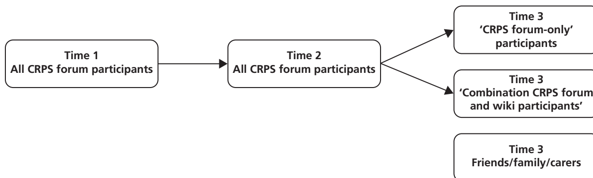
FIGURE 1 Three-phase approach.

Initially, participants for phases 1 and 2 were drawn from a convenience sample consisting of members of crps@themain. Crps@themain was an independent support group formed by and for those who have been diagnosed as having CRPS and who have completed, or are currently undergoing, the rehabilitation programme run by the RNHRD. It changed its name to CRPS-UK and was subsequently suspended for much of our research study because the volunteers running the site were struggling to manage their commitments in addition to coping with their own CRPS. CRPS-UK has recently been relaunched (12 October 2013) in a limited capacity as a static website with the intention of introducing a Facebook site. Each year, the RNHRD sees approximately 80–100 new CRPS patients, all of whom are informed of the existence of the patient-run support group. This support group's website functioned as a static online information resource, rather than an interactive forum.