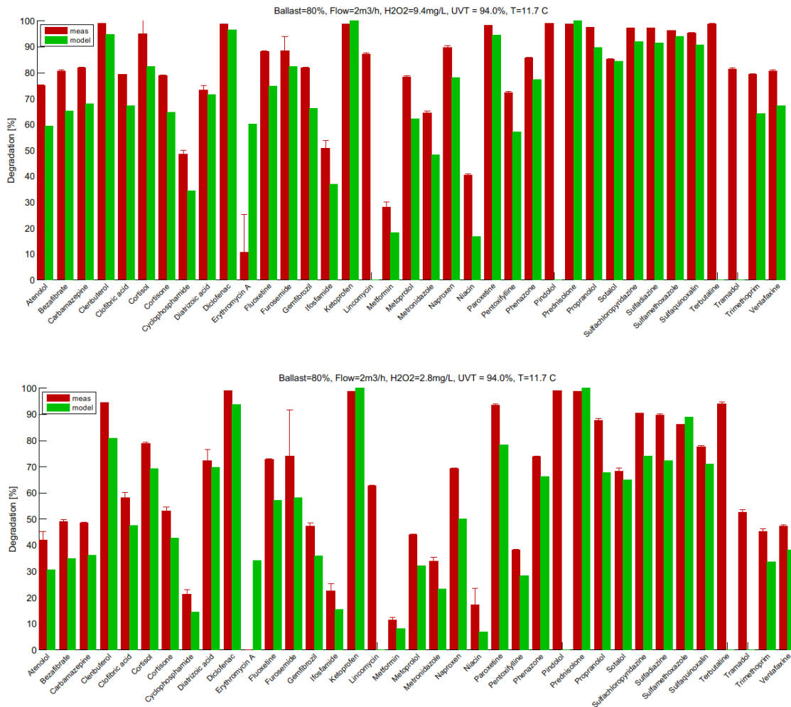
Figure 2: Measured versus predicted conversions at site WML. Upper panel H 2 O 2 concentration 9.4 mg/L, lower panel 2.8 mg/L

of about 30-70%. The ACF seemed to be more efficient, as it both increased UV-T and reduced DOC content. The effect of a higher UV-T especially could be observed for the NEW reactor, as this had been designed for a situation with a high UV-T value. The effect of different water matrix compositions on the reactor performance is shown in figure 3.