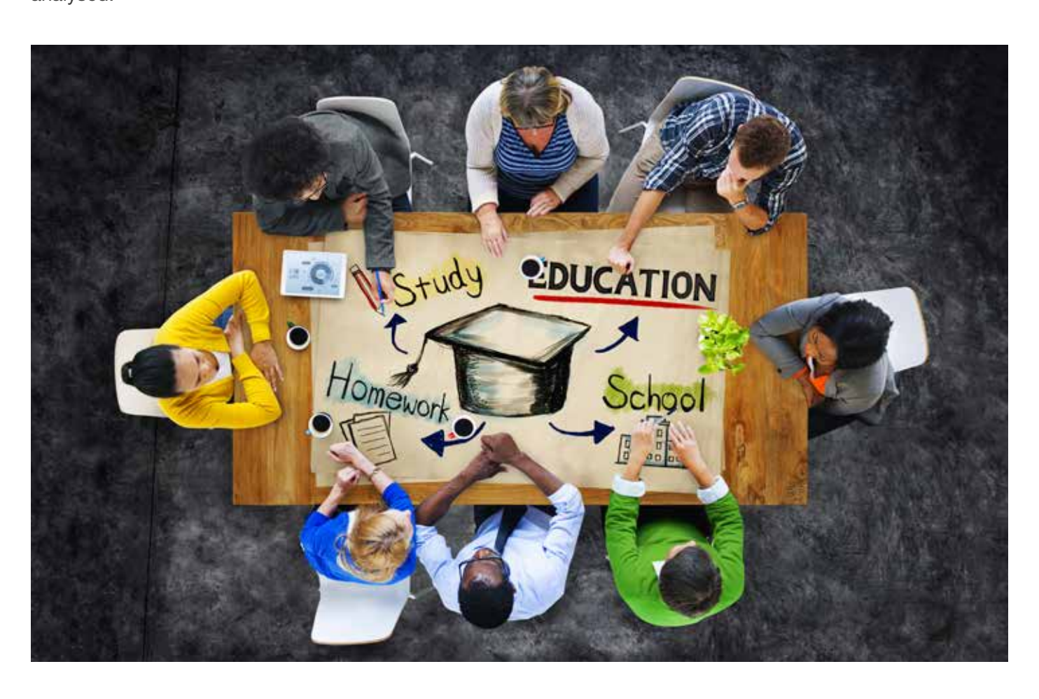
Date of release: November 2014