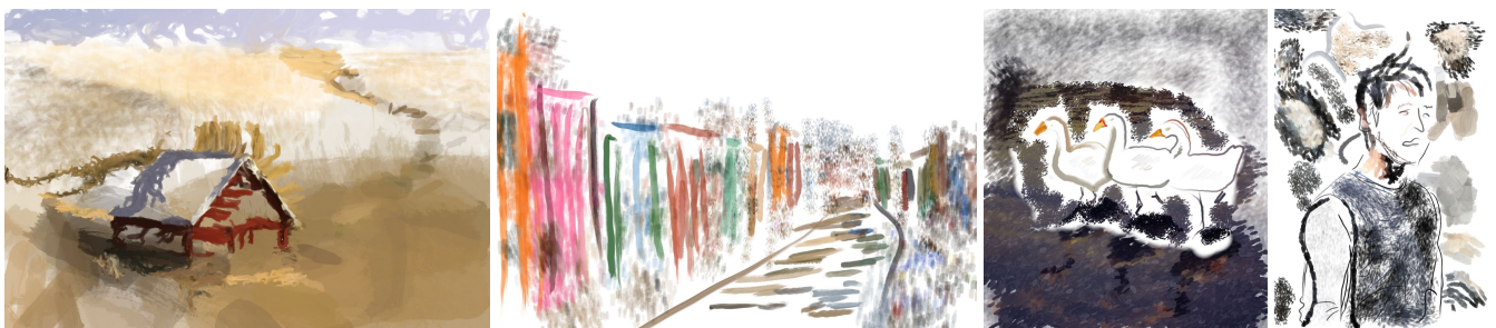
Figure 8. Four “failure” results, where the user was not able to exploit the system to reach the intended completion of the painting.