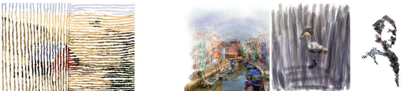
Figure 9. Four “creative” interesting results, where the user has been able to express a unique personal style.