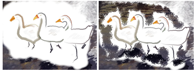
Figure 4. (Left): Foreground elements (geese) drawn first; (Right): Attempts to fill in background (space between geese) results in irregular background and noticeable seams between foreground and background.

While we instructed users in the use of the UI, we did not advise them on any painting related strategies. Consequently, when coding the users’ log files we observed a number of common painting technique challenges, along with tech-