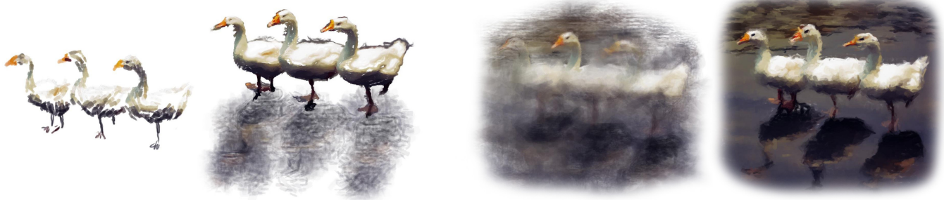
Figure 1. Several examples of geese painted by novice users with Painting with Bob in under ten minutes.