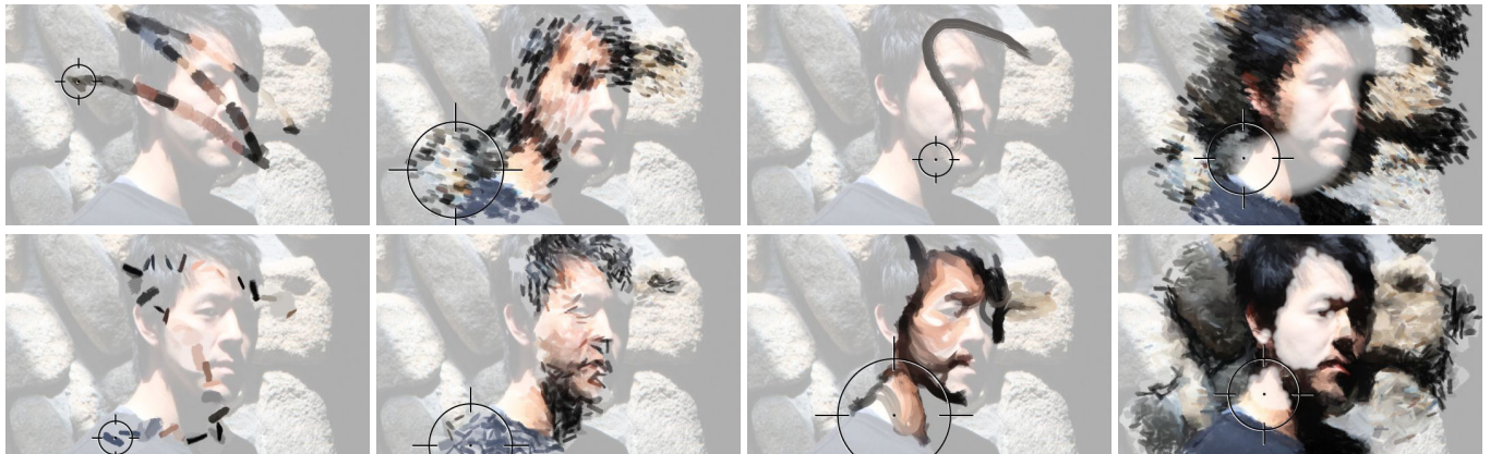
Figure 3. Examples of a single user interaction. Top: Simple tools. Bottom: Smart tools. From left-to-right: Single, Fill, Structure, and Eraser