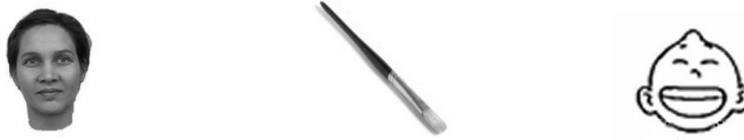
Figure 1. Example of Social-Face, Non-Social and Social-Cartoon stimuli used in the experiment