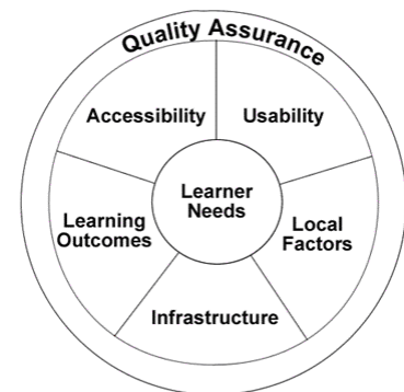
Figure 1: Holistic Framework For E-Learning Accessibility

As well as the flaws in the WAI model, the WCAG guidelines themselves are flawed. Kelly et al (Kelly, 2004) have argued that the poor level of compliance with WCAG guidelines which has been observed in many sectors (including higher education, museums and even disability organisations themselves) reflects, not necessarily a lack of motivation to support users with disabilities but rather a failing in the guidelines themselves. In the light of these issues the authors feel that a slavish commitment to WAI guidelines is inappropriate and that an alternative approach is needed. A holistic framework for e-learning accessibility has been developed by Kelly et al (2004) which takes a user-focused approach to Web accessibility, rather than the conventional checklist approach. This framework is illustrated in Figure 1.