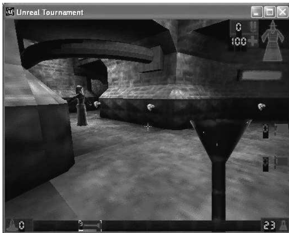
Figure 4.1: the blue bot runs towards the goowand on the floor.

This final segment illustrates a problem discussed in section 5.3.4: the expiry of out-dated