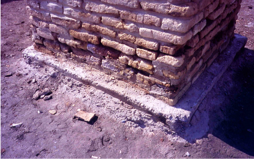
Fig. 4. Concrete platform with reconstructed masonry as carried out before perestroika. The picture shows also salts weathering in the lower courses