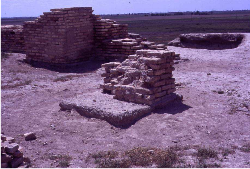
Fig. 9. After comparing archival pictures and reconstructed work (Soviet times), demolition of reconstructed parts was carried out. Only the original portions were left, see Fig. 8. The Soviet-period concrete platform could not be demolished because this would have originated damage of the historic masonry