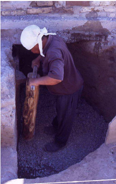
Fig. 10. Old Mosque, minaret area. From top to bottom: fired brick courses, Soviet concrete ring footing, and excavated rubbish pit being consolidated with a conglomerate of gravel and soil