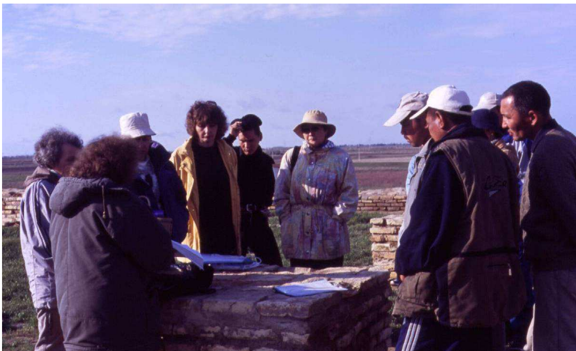
Fig. 6. Old Mosque: group study of masses through survey sheets. The treatment plan for every structure was discussed and agreed by the interdisciplinary group

It should be noted that the assessment of structures before removal of cementitious repair was updated with the new details that were revealed after cleaning. Laboratory analysis showed that the mosque pillars were built with ganch mortar (a mix of gypsum, soil, and crushed fired brick) with varying composition from structure to structure. The analysis of mortar through x-ray diffractometry 4 (Table 1) shows that there is a clear difference between lower courses (high content of gypsum up to 69.3%) and higher courses (low content of gypsum down to 34.1%). Analysis of one sample taken from the core of pillar number 18 showed 29.5% content of gypsum.