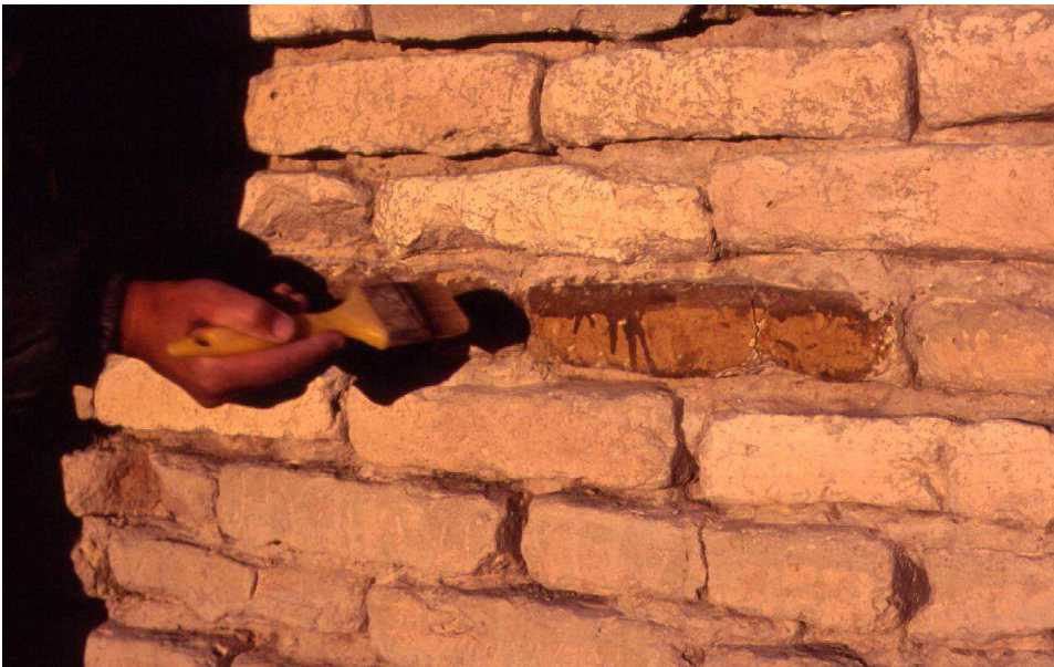
Fig. 11. Removal of ethyl silicate treatment runs from fired brick with solvent

Repointing of the quybla and outer wall was started during the autumn 2003 season with the following repointing mix: 50% gypsum (manufactured in Taraz), 20% soil, 15% air lime, 15% crushed fired brick. Cleaning and application of the mortar was carried out by employing the same methods and techniques as in other structures at Otrar (Fodde 2007). Chemical treatment runs were removed by dusting with a bristle brush, brushing with water, and brushing with solvent toluene (Figs 11-12). Then a pack of cloth and water was applied, and after one day the brick surface was rubbed with cloth. Such solvent was tested during the spring 2003 campaign and proved to be effective in removing consolidation runs. However, it was noticed that after the cleaning process several bricks lost some of their patina, but this was considered to be acceptable.