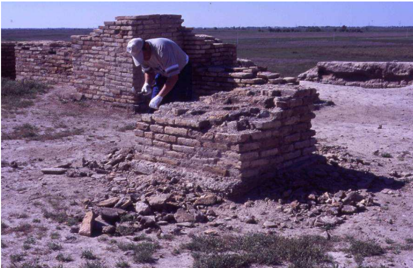
Fig. 8. Authentication work of the old mosque structures showed that major reconstruction with cementitious mortar was undertaken before perestroika. Demolition of such reconstruction revealed the extent of concrete platforms that were built by Soviet conservators (see also Fig. 9)