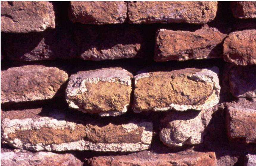
Fig. 5. Fired brick spalling (2003) caused by the combined action of ethyl silicate consolidation as applied by Soviet conservators and of salts and water from the brick itself. The depth of the ethyl silicate treatment is shown by the lighter areas that tend to deteriorate and detach