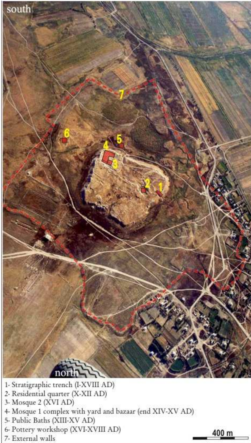
Fig. 2: Aerial picture of Otrar Tobe 3 with main archaeological features