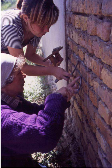
Fig. 7. Mortar trials were made on new walls before application to the Old Mosque. This was done because it would have been unethical to test repair material on the historic fabric