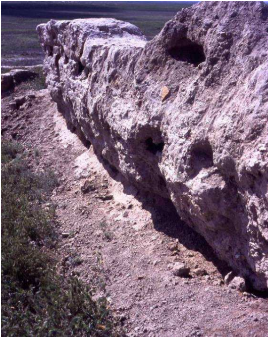
Fig. 3. The Otrar oasis is characterized mostly by earthen dwellings such as this one located in Altyn Tobe (2002). The structure shows caving as caused by a combined effect of salts attack and wind blown silt.