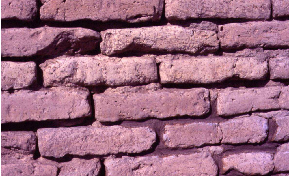
Fig. 12. Picture showing same portion of wall as in Fig 11 after cleaning and application of repointing mortar