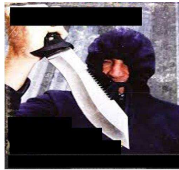
(aggressive) Masculinity poster