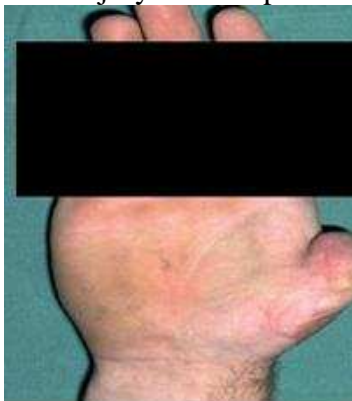
Mild injury-themed poster