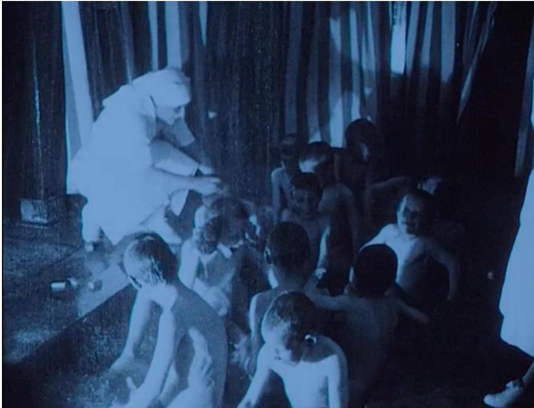
Fig. 3. Sanatorium des enfants - Usine de Dudelange. Frame from Vu Feier an Eisen (reconstructed 1997 version of Columeta , 1921/22), courtesy of CNA, Luxembourg. (1:09:10)