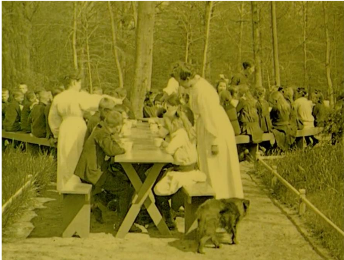
Fig. 5. L'école en forêt de Dudelange. Frame from Vu Feier an Eisen (reconstructed 1997 version of Columeta , 1921/22), courtesy of CNA, Luxembourg. (1:11:13)