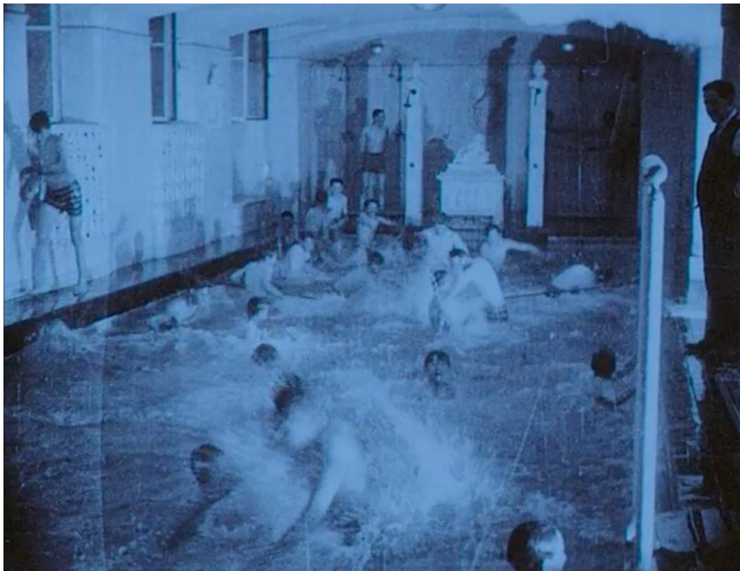
Fig. 4. Institut Émile Metz . Frame from Vu Feier an Eisen (reconstructed 1997 version of Columeta , 1921/22), courtesy of CNA, Luxembourg. (1:15:43)