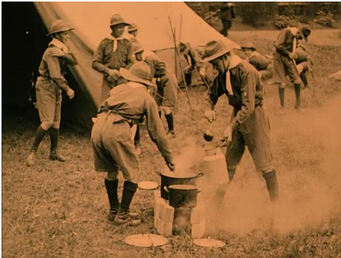
Fig. 6. Institut Émile Metz. Frame from Vu Feier an Eisen (reconstructed 1997 version of Columeta , 1921/22), courtesy of CNA, Luxembourg. (1:17:37)