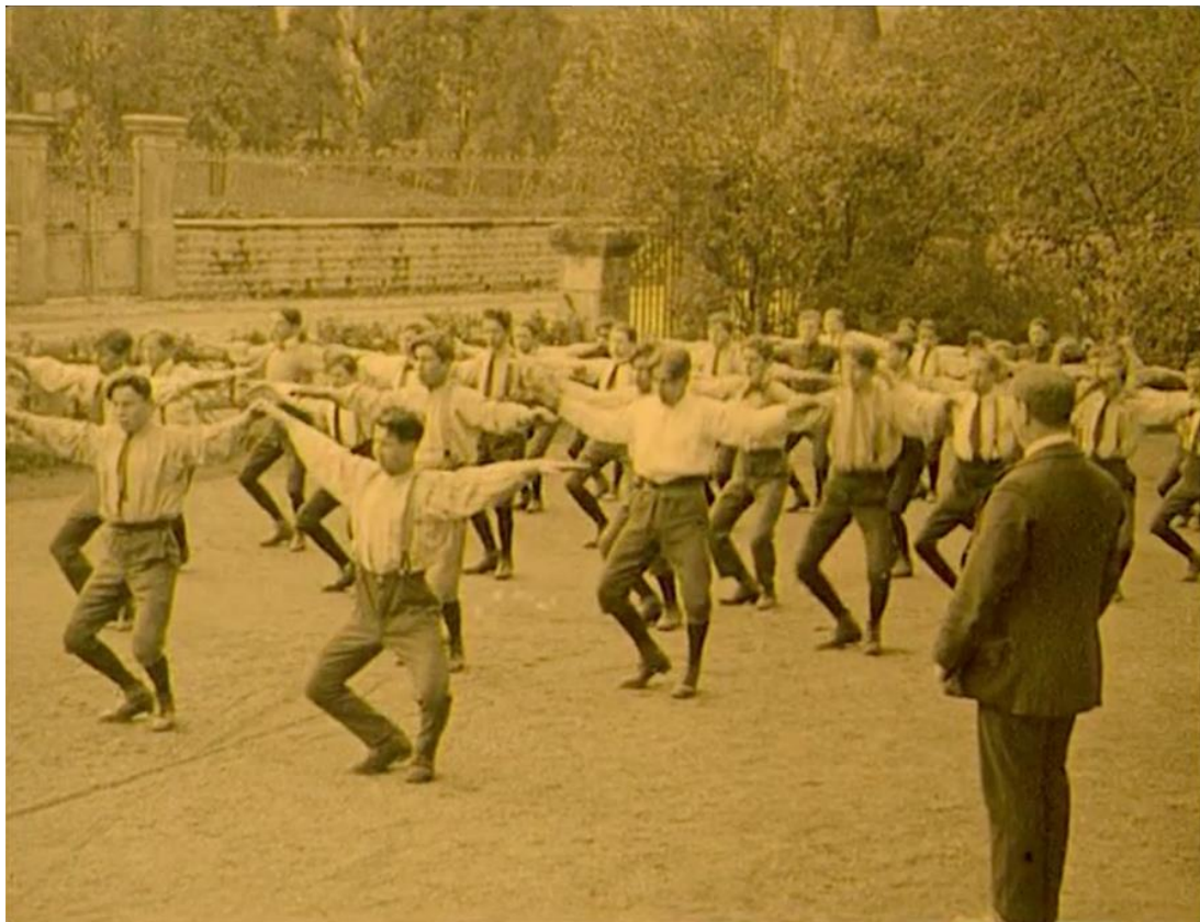
Fig. 2. Institut Émile Metz. Frame from Vu Feier an Eisen (reconstructed 1997 version of Columeta , 1921/22), courtesy of CNA, Luxembourg. (1:15:02)