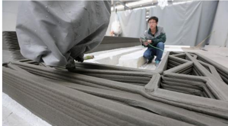
Figure 1: Winsun Decoration Design Engineering Co. Concrete 3D printing homes technology ( http://www.yhbm.com/index.php?m=content&c=index&a=lists&catid=67 ).

Winsun Decoration Design Engineering Co. already advertises the 3D printing of homes as a 'Product' ( yhbm.com , 2015) (Figure 1) and Brian Peters (2013) has developed 3D printers capable of 3D printing customized bricks that are parametrically optimized around structural and ornamental performance.