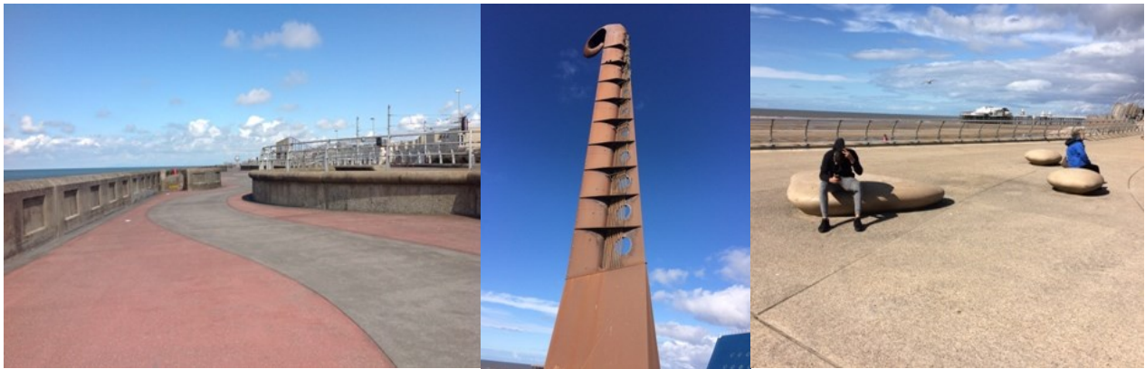
Figure 5: Multi-sensory qualities

concrete, steel, zinc and copper sheet, installed in 2002 and designed by Liam Curtin and John Gooding. The organ, described as a 'musical manifestation of the sea', is operated by the surges of the tide to produce harmonic sounds that resonate through the 18 pipes that emerge from within the sculpture. The sound is initially produced by waves that push air into and up into the eight pipes attached to the seawall below. The melodious and harmonious quality of the music thus depends upon the force of the tide, and this is especially loud on stormy occasions.