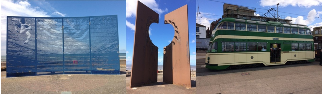
Figure 1: place-based designs

These references to Blackpool's popular culture proliferate along the promenade. Colourful stalls are adorned with giant plastic ice cream cones, vibrant illuminations are affixed to the roadside lampposts and strung above the road, posters advertise tribute acts, a plastic life size figure of Elvis Presley and a lurid children's' roundabout lie in wait. The juxtapositions of these unlikely objects and images produces a vernacular surrealism, a trait particularly exemplified by the box belonging to the Theatre d'Amour , a simulation of a Victorian theatre created by celebrity designer Laurence Llewellyn-Bowen and illuminated at night. The box hosts comedian Ken Dodd replete with tickling sticks, Coronation Street actor Thelma Barlow (who played the role of Mavis Riley / Wilton in the long-running soap opera), and pop star Robbie Williams. Such aggregations of popular cultural motifs, models and images constitute a key dimension of the disorderly carnivalesque aesthetics of the British seaside, echoing the bawdy and absurd texts of the Comedy Carpet , discussed below.