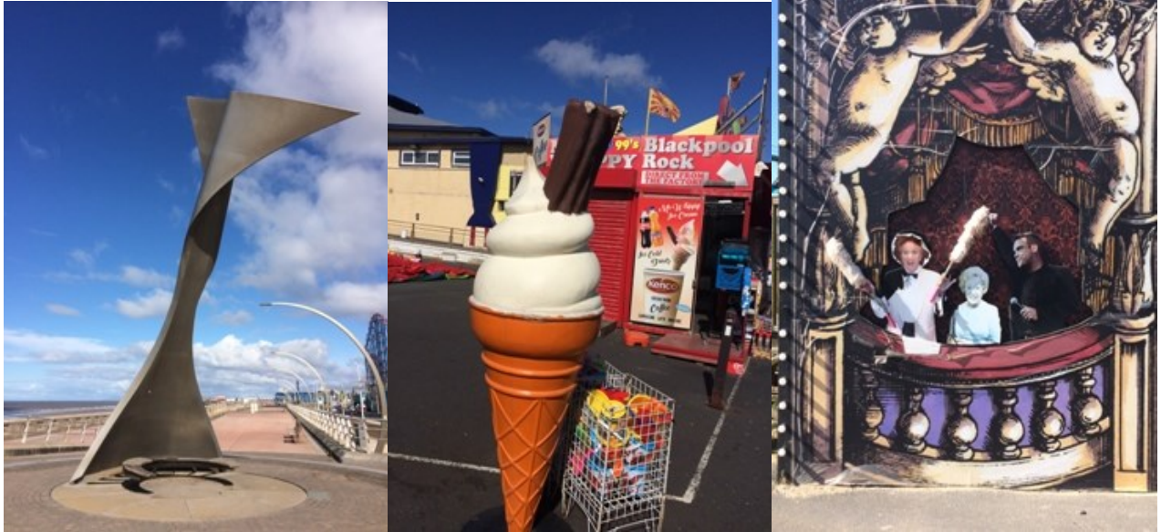
Figure 2: Vernacular surrealism

These random juxtapositions contrast with current tendencies to design space according to coherent, pervasive themes (Gottdiener, 1997). They affirm the cheerful vernacular aesthetics of fairground stalls, amusement arcades, souvenir shops and illuminations, and also appear at the entrances to the three piers where lurid advertisements broadcast shows featuring singers, comedians, magicians and other popular entertainers. The designers of the promenade thus honour Blackpool's traditions of celebrating the vital qualities of British popular culture and vernacular tastes, with little concern for taming the excessive, expressive visual effusions and light-hearted pleasures that erupt along the seafront, and indeed honour these in the sculptures discussed above. By contrast, elsewhere, designers pay little heed to popular culture in plans to redevelop streets, though its dynamic and protean nature, especially where it is entangled with local identities, are we claim, worthy of celebrating (Edensor et al 2009).