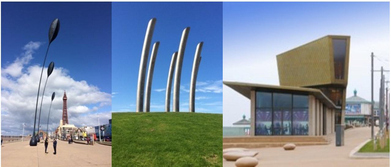
Figure 3: Cutting edge designs

imposed order of the original design to become something completely different' (Vilaseca, 2014: 217).