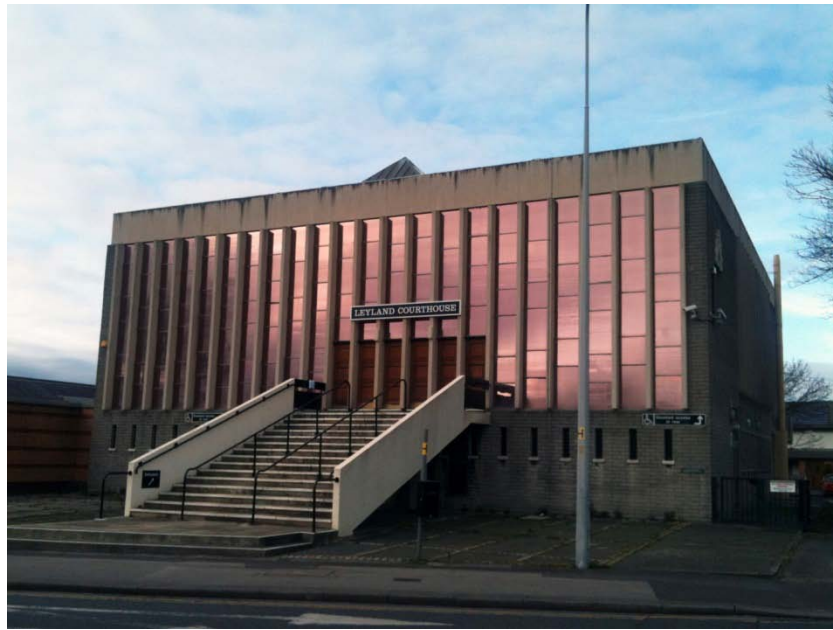
Figure 3. Leyland Magistrates' Court, Lancastergate, Leyland, Lancashire, designed by Lancashire County Council Architects, 1970 (the author).

In Leyland a civic core was started. Two examples of township civic architecture by Lancashire County Council Architects' Department are the Magistrates' Court and Library at Lancastergate, Leyland, 1970. The Magistrates' Court (figure 3) is a dominant grey brick box topped with two copper roof pyramids. Key features of the street elevation are the wide external staircase and a band of vertical concrete fins which define the windows and six single-leaf entrance doors. Vertical windows are repeated on the side elevations. Adjacent to the court is the library. Also in grey brick with three acute roof pyramids, this is a single-storey brutalist building.