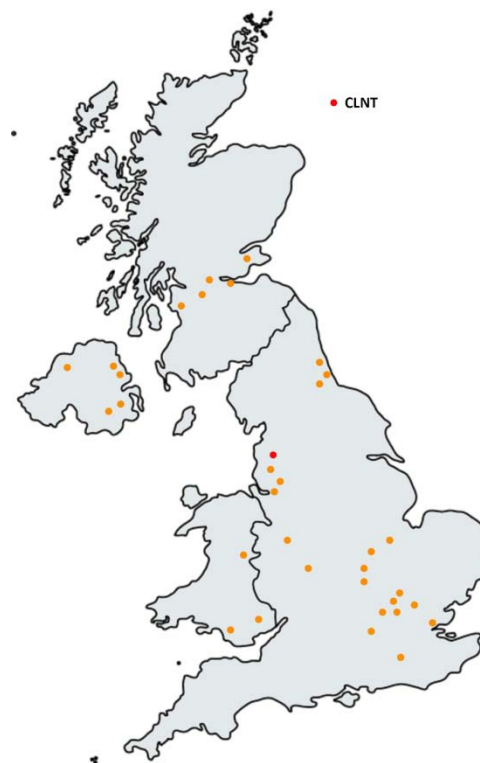
Figure 2. Proposed and constructed New Towns, 1965 (the author).

the passing of two revolutionary Acts – the New Towns Act 1946 and the Town and Country Planning Act 1947, followed. Welwyn became part of the first generation of New Towns when a government appointed Development Corporation adopted it under the New Towns Act in 1948. The need for 20 new towns had been identified and between 1947 and 1950 fourteen had been started – twelve in England (eight to relieve London) and two in Scotland. After 1961 came a second wave of new towns and by 1968 eight more were in progress (six in England and two in Scotland) (figure 2). During the late 1960s changes to the New Towns Act allowed Development Corporations to co-operate with local councils to plan major expansions of existing towns to create regional or sub-regional centres and undertake urban development over extensive areas already containing a number of small towns and villages not suitable for individual expansion. These were not new towns but large-scale town expansions.