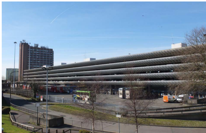
Figure 1. Preston Bus Station, Lancashire, designed by the Building Design Partnership, 1959-70, (the author).

the region, after Manchester and Liverpool, and its master-plan, which was being developed simultaneously to the bus station's design, could have accommodated a predicted population increase from 253,000 people in 1966 to 503,000 in 1991 over 51,460 acres. Designated in 1970 CLNT is significant because it was the last and largest of the third generation new towns proposed in Britain between 1961 and 1970 and it demonstrated an unprecedented application of the Act. Over a period of thirty years the strategy, configuration and scale of a New Town for central Lancashire changed leaving an interesting architectural legacy dispersed across the region and, as in the case of Preston Bus Station, a contemporary debate concerning the future of its city-scale buildings.