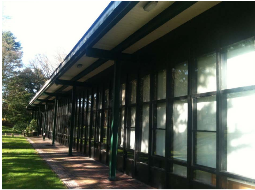
Figure 4. Cuerden Pavilion, Cuerden Hall, Lancashire, designed by Robert Matthew Johnson Marshall, 1971 (the author).

The headquarters of Central Lancashire New Town's Development Corporation was first building constructed for the city following the New Town's designation in 1970 (figure 4). The Development Corporation had selected Cuerden Hall and Park for its location, a historic building of local interest set within mature grounds and diplomatically placed in the centre of the designation area with no apparent favouritism to Preston, Chorley and Leyland. At the time Cuerden Hall was occupied by the armed forces and was due to be vacated in 1973, when it was to become a public amenity. Designed by RMJM, the building is noteworthy due to its rapid construction and its simple and elegant expression. The close working relationship of architect, engineer and quantity surveyor and the careful selection of materials enabled it to be completed in four months ( The Architect's Journal , 13 September 1972). Unified by a generous flat roof, the external envelope comprises a lightweight prefabricated timber and glass external walls set back from a framework of standard rolled steel sections to form a shaded cloister. Internally, two permanent central service cores subdivide an adaptable