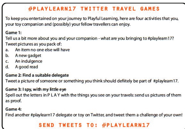
Figure 1. Twitter travel games.

Organisers managed numerous alter ego accounts including other toys, toy keynote speakers, and, as had proved popular at previous conferences, an evil Twitter presence.