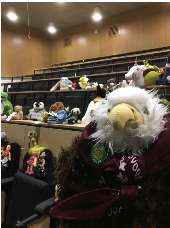
Figure 3. Toy keynote; TED Talk with Prof Prod Eagle.

The tweets from PL highlight some interesting statistics. The pre-conference activities were much more popular with the ‘toys’ which was unsurprising given that they were the target of this game, with over three times as many tweets from toys as people in the 4 days prior to the start of the conference (Figure 4).