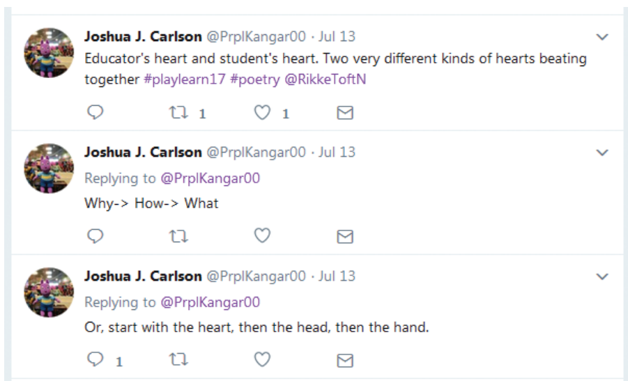
Figure 7. Example of an account where the toy tweeted as you may expect a person to.

Approximately, a quarter of the delegate paper responses mentioned the toy conference game in their evaluation of the conference and all of these mentions were in response to their favourite aspect.