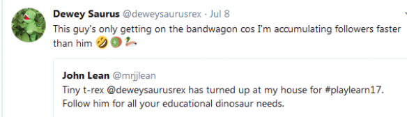
Figure 6. Example of accounts kept separate throughout the conference.