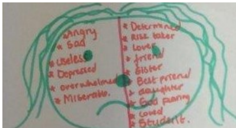
Figure 2: Ntombi's drawing of a two-sided face

Ntombi's drawing (Figure 2) of her face with a happy and a sad side, indicates her ambivalence about whether or not she is good enough to be at university. This face is foregrounded, highlighting the importance of these thoughts. This ambivalence is supported by her spoken narrative;