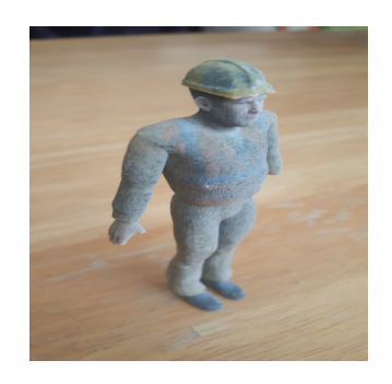
a. AR Experience