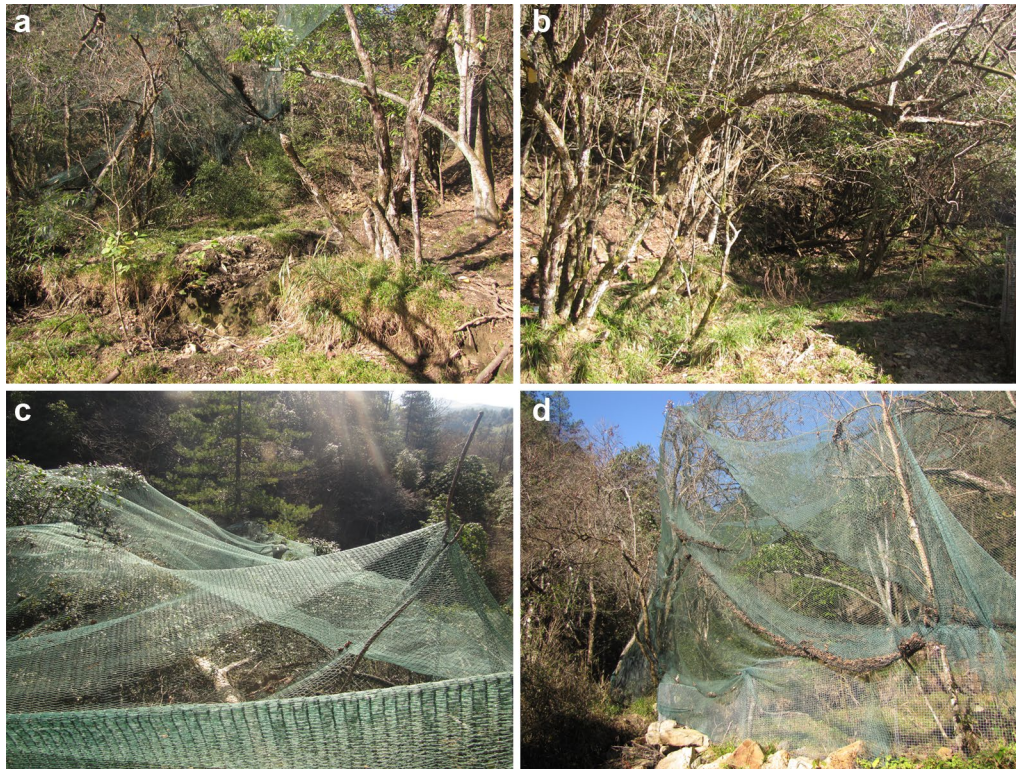
Fig. 2 The soft-release enclosures used for the reintroduction of Cabot's Tragopan at the Taoyuandong National Nature Reserve, Hunan Province, southern China ( a, b inside of enclosure; c, d outside of enclosure).

longer experimental acclimation training period. The first group consisted of ten “trained” or “acclimated” birds (five males and five females). The birds of the second group were “untrained” and remained in the enclosure for a much shorter period; this group consisted of eleven birds (five males and six females). One male bird belonging to the longer acclimated trained group died before release. The remaining individuals were kept in the soft-release enclosure for more than 50 days (five birds were kept for 53 days and four for 56 days). Following the dietary recommendations for captive tragopans published by the HWRBC, we provided 100 g corn per tragopan every day at the beginning of acclimation training. We placed corn in different areas of the enclosure and gradually reduced the feeding frequency to 100 g per tragopan every 3 days from day 11 to day 20 and every 6 days from day 21 to day 30. After 30 days, we provided only 100 g per tragopan every 10 days. Five birds, kept in the enclosure for 53 days, were released on 3 October 2011. Another four birds, kept in the enclosure for 56 days, were released on 23rd October 2011. The shorter acclimation untrained group spent only 3 days within the soft-release enclosure prior to release as two release cohorts. Four pheasants (two males and two females) of