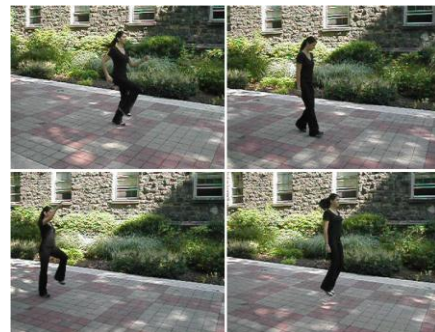
Figure 1. Sample frames from clips.