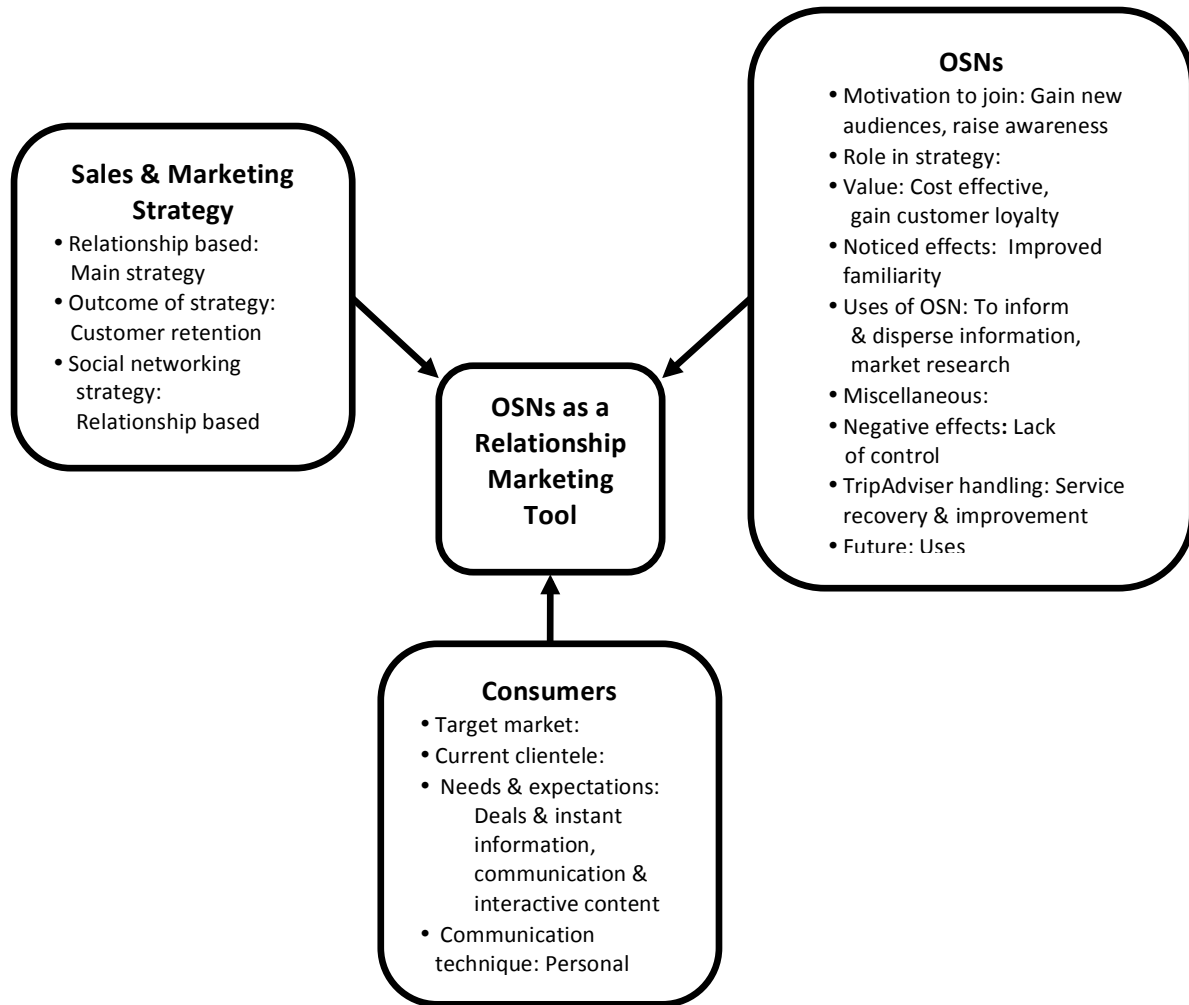
Figure 1. Conceptual Model: Summary of Main Themes, Sub Themes and A Priori Themes Pertaining to OSNs as a RM Tool

The main themes fell into three broad areas: Sales and Marketing Strategy, OSNs and Consumers.