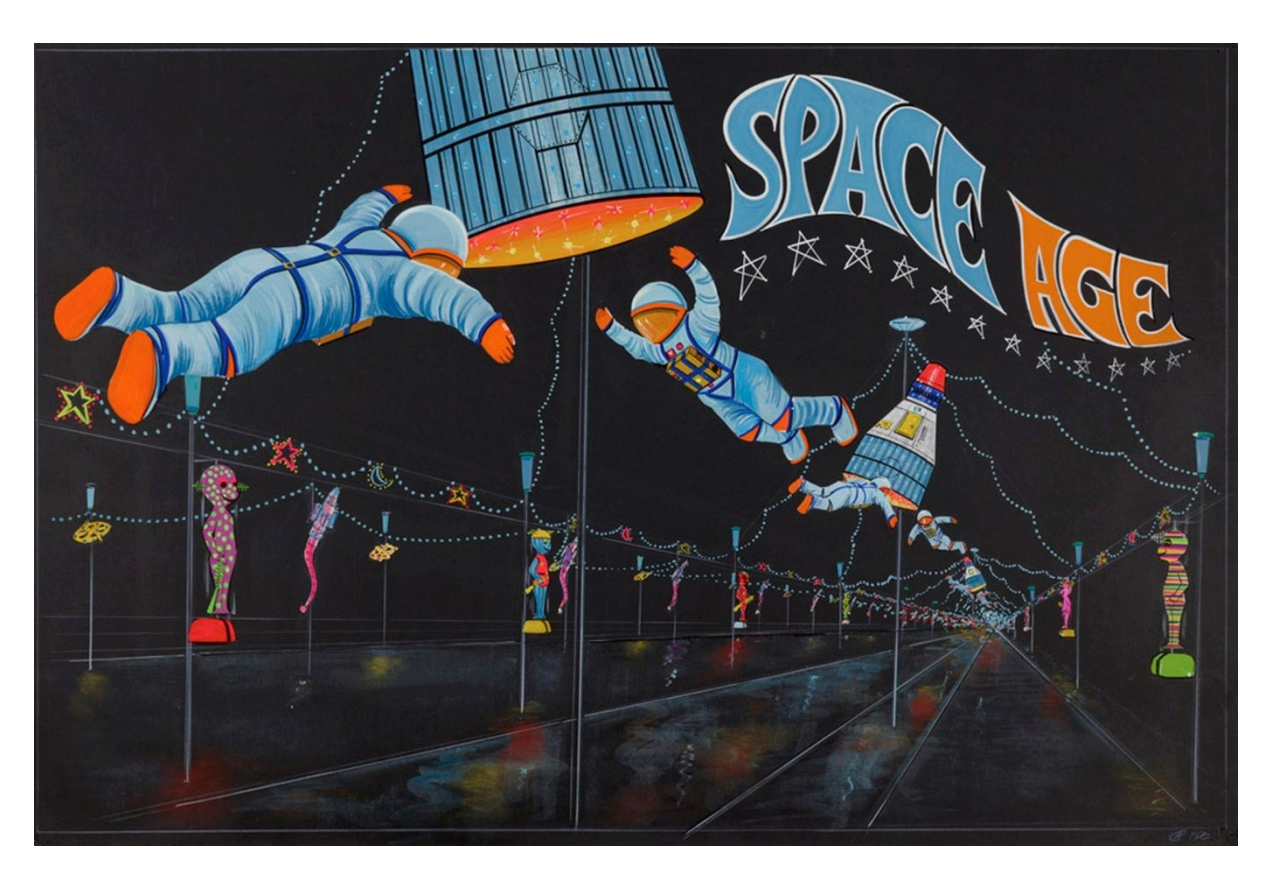
Figure 2: Design for Space Age , 1970s