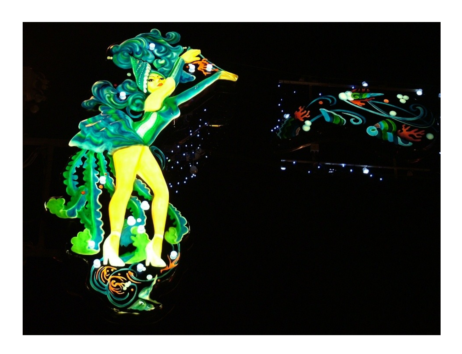
Figure 3: DecoDance, 2007