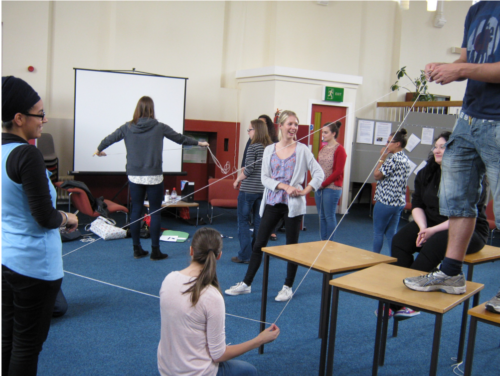
Figure 2. “Conceptualising” a 3-dimensional object using string.

This experience was written up at home as part of a diary package that would eventually be submitted for the course assessment. The course is set up at the outset as a place where we all research how people learn mathematics. Starting with ourselves and our own learning we tell stories of our experiences towards building some sensitivity to understanding how similar situations can be experienced in very different ways and that our own learning can be enhanced by trying to see my problem through someone else’s eyes. We explore our respective beliefs and expound the rationalities that link them. For example, two students in the same subgroup experiencing the same discussion documented the different ways in which they saw their colleagues had made sense of the problem: