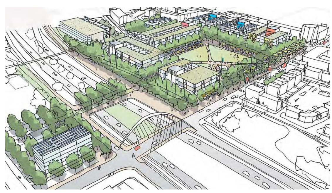
Artist's impression: image from Strategic Development Framework document