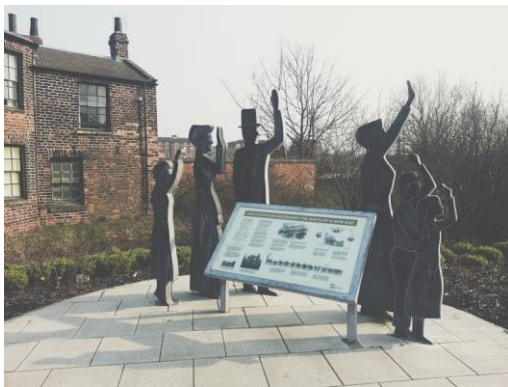
Figure 1. Public installation of Stockton-Darlington railway

Stockton and Teesside's historical legacies and current trajectories have been the subject of much academic research – the Teesside region has anecdotally been referred to as both 'research laboratory' and 'policy laboratory' (Shildrick et al., 2010). By having this rich body of research to draw on, we are better able to understand contemporary and future patterns of the dynamic ways of life in this place. The different types of research, from sociological examination into the impacts of poverty on everyday life (Shildrick et al., 2010), industrial development and decline in the area (Beynon et al., 1994) to the effects of participatory research on social justice (Banks, Herrington and Carter, 2017; Banks et al., 2013) enhance our understanding of Stockton and allow us to understand the 'biography of place' (Warren and Garthwaite, 2014a) from multiple angles, incorporating individual, spatial, economic and community biographies.