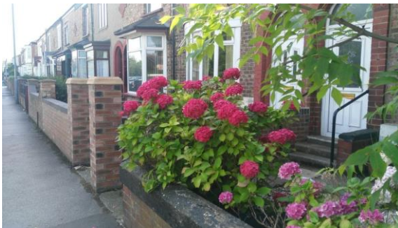
Figure 8. Flowers blooming in a front garden in the town centre

To learn hope is to see the force in the present of a world that does not yet exist but could do: the strength here and now of that which does not fit, of that which screams, however silently, 'No, we do not accept, we shall create another world.'