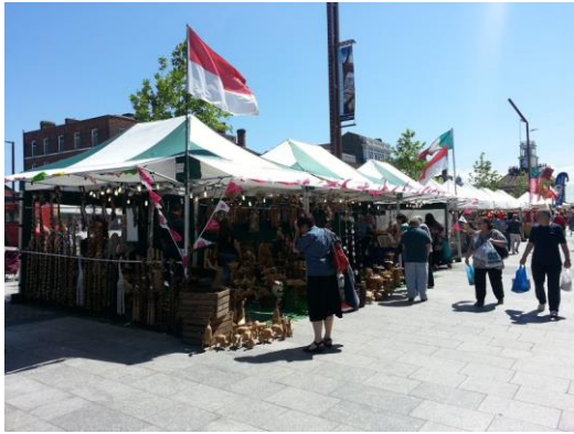
Figure 4. Market day on Stockton high street