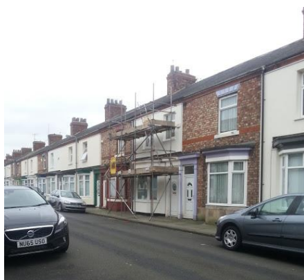
Figure 7. Row of terraced housing in town centre