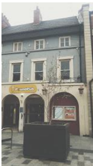
Figure 5. Pound Pub on Stockton high street

2016). Opinions about who it was redeveloped for were ambivalent and mixed. There was a general feeling, however, that many in Stockton were doing badly under austerity, and this costly regeneration by the council sat uneasily with them, at a time of so many cuts.