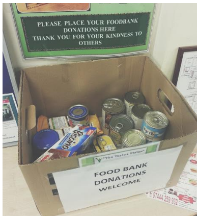
Figure 6. Foodbank collection at Thrive

The 'Big Society' rhetoric has pinpointed middle-class voluntarism as the utopian ideal at the heart of Coalition's project of localism. Certain homogenising ideas of community have been played up, which has been intensified under austerity. This is particularly problematic in the disadvantaged areas affected by state retrenchment (Featherstone et al., 2011) where charities such as foodbanks step in where the state has retreated. Dowling and Harvie (2014) have pinpointed two of the main aspects of the Big Society rhetoric as the retreat of the state in service provision, the expectation that volunteers will plug any gaps in services, alongside the devaluing of the role of social reproduction, 'placing the associated costs onto the unpaid realms of the home and the community' (2014: 870). It simultaneously allowed tasks associated with social reproduction to be 'harnessed for profit – thus providing a potential source of new capitalist accumulation, enabling an increasing 'financialisation of daily life' (Martin, 2002) and a deepening of capitalist disciplinary logic (Dowling and Harvie, 2014: 870).