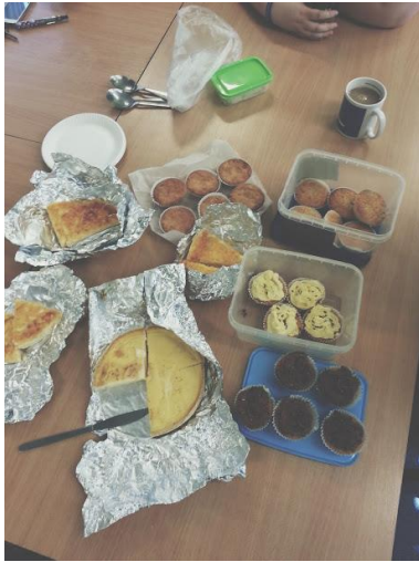
Figure 3. home baking at the women's group