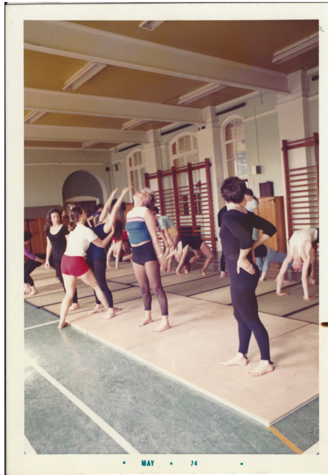
Figure 3: A 1970s yoga class taught by students of B.K.S. Iyengar in a school gym in London.

that some of the first teacher training programs and yoga teaching certificates began to be developed.