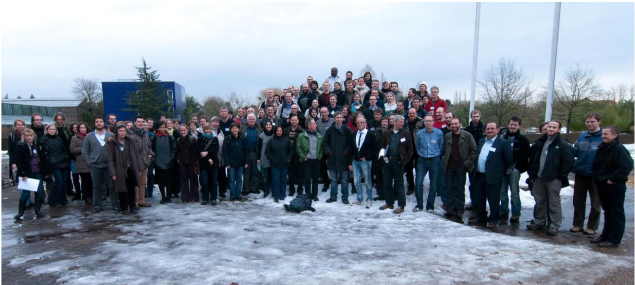
Fig. 1: Conference participants in front of the Biocentre Klein Flottbek in wintery Hamburg, February 2010.