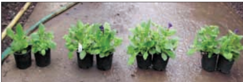
Fig. 2.: Difference among groups at the end of the experiment (from left to right: Control; 0,1% FL; 0,2% FL; 0,3% FL)

Based on the results the use of Ferbanat L gave good progress towards the Petunia x grandiflora 'Musica Blue'. The most appropriate concentration was 0.1%, which gave the best results in the shoot length. Although in the aspect of leaf length and flower bud number the 0.1 % concentration gave weaker results than the control group, but the difference was not significant. In all the treated groups the flower buds appeared five days earlier comparing to the control, therefore earlier flowering occurred, so the growing period shortened (Fig. 2). It has importance in the horticultural practical aspect.