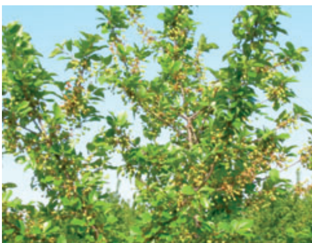
Photo 4. Fruit sets of not damaged cv.'Újfehértói fürtös' (May 2011. Újfehértó)

Air temperature data at the time of the frost event were presented in Table 1. From the data of Table 1 it was evident that at dawn of 6 May significantly and suddenly decreased the air temperature. The low humidity content of air (mean vapour content of air was 47%) and the low motion of air (1,94 m/s) strengthened the degree of frost.