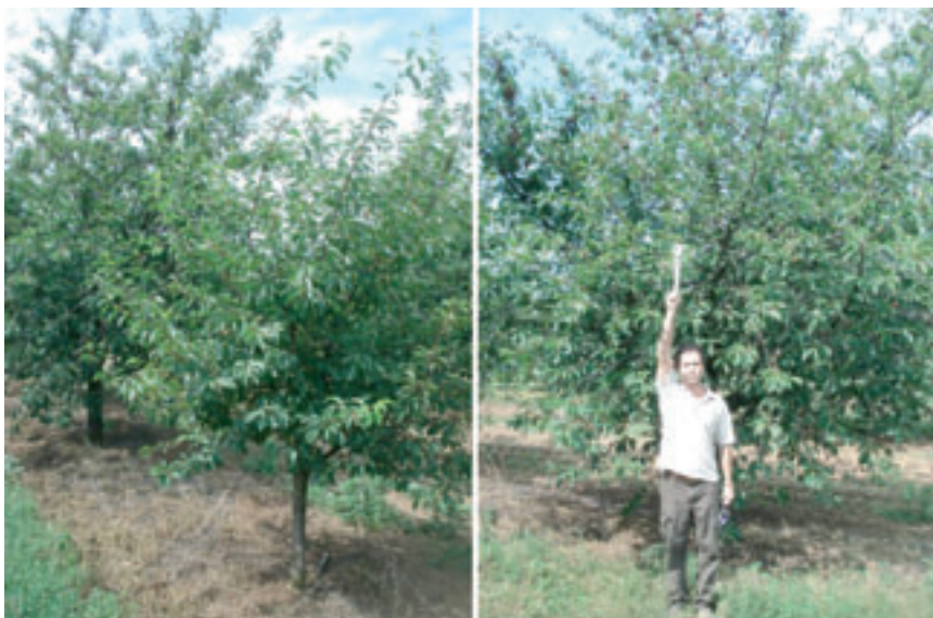
Photo 1 and 2. Damaged cv. 'Kántorjánosi 3' (left) and damaged cv. 'Újfehértói fürtös' (right) (Újfehértó, June 2011.)