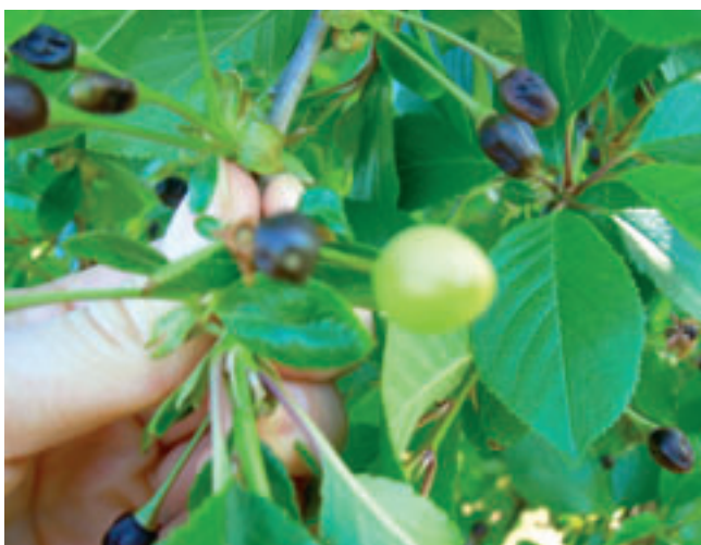
Photo 3. Fruit sets of damaged cv.'Újfehértói fürtös' (May 2011.Újfehértó)