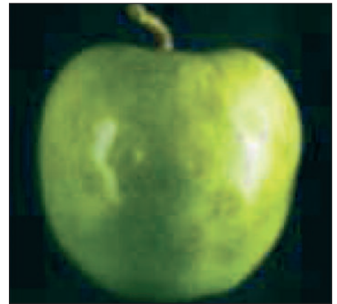
Photo 2: External cork symptoms in Granny Smith apple (bumpy spots and irregular shape)