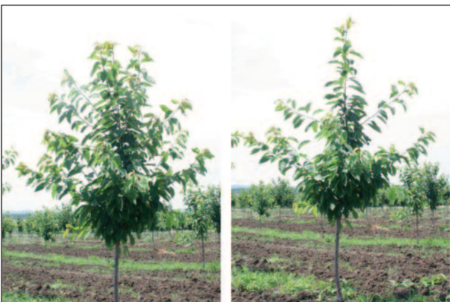
Figure 3. Young cherry tree before and after summer pruning