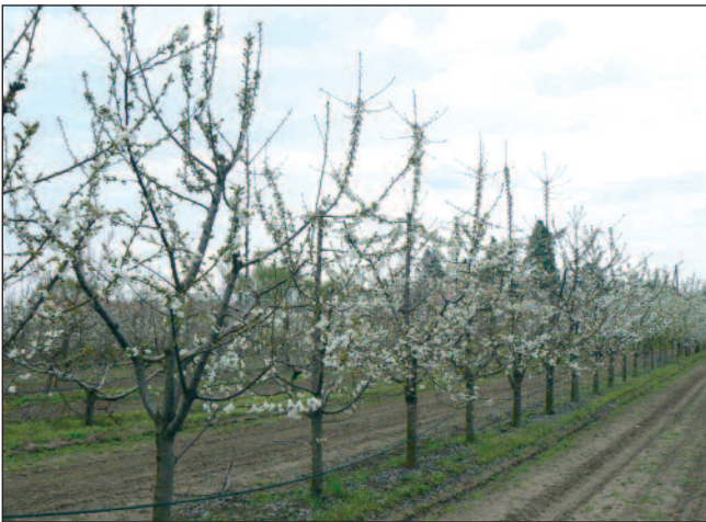
Figure 2. Cherry trees trained to free spindle, planted to 5×2 m design