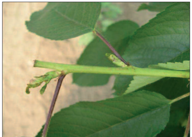
Figure 6. Halving of the shoots stimulates the ramification of the tree