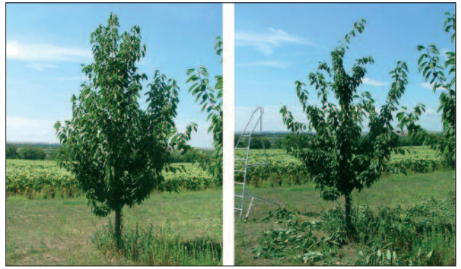
Figure 4. Cherry tree before and after postharvest pruning