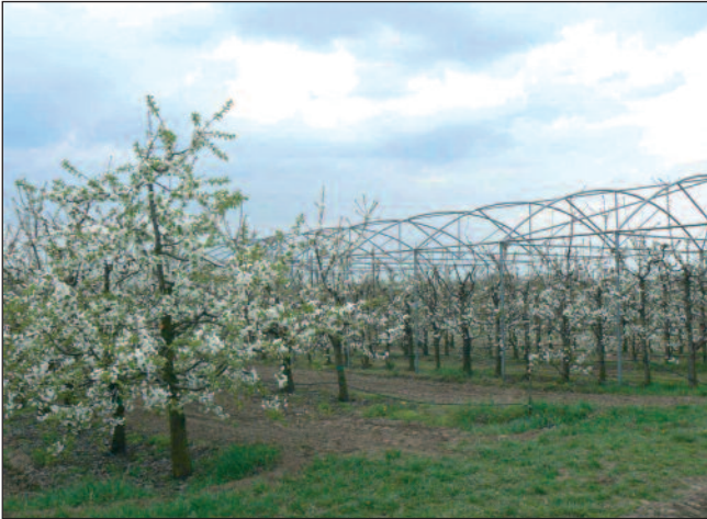
Figure 1. Foreground: Free spindle tree in a planting to 5×2 m distance. Background: Slender spindle trees in a planting to 4×1 m

Beginning with the third year, 3 or 4 vigorous shoots are left without restriction to grow on the upper or middle position, and they will be tied to horizontal position. Further on, the restriction of space ought to be necessary. Sometimes, a reduction of shoots to spurs, to branches of two years will be needed in order to secure adequate illumination (Gonda, 2010).