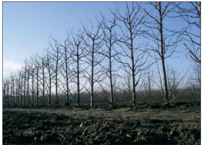
Figure 5. 5-year-old cherry trees trained to super (slender) spindle crowns