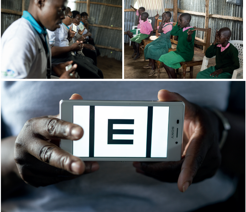
Figure 1 Top: Teachers screening children using Peek Acuity in a school in Trans Nzoia County, Kenya. Above: the Peek Visual Acuity app on a smartphone.

n all school eye health programmes, there are usually a number of factors which limit implementation, which can include a lack of trained personnel for screening, accurate diagnosis and acceptable