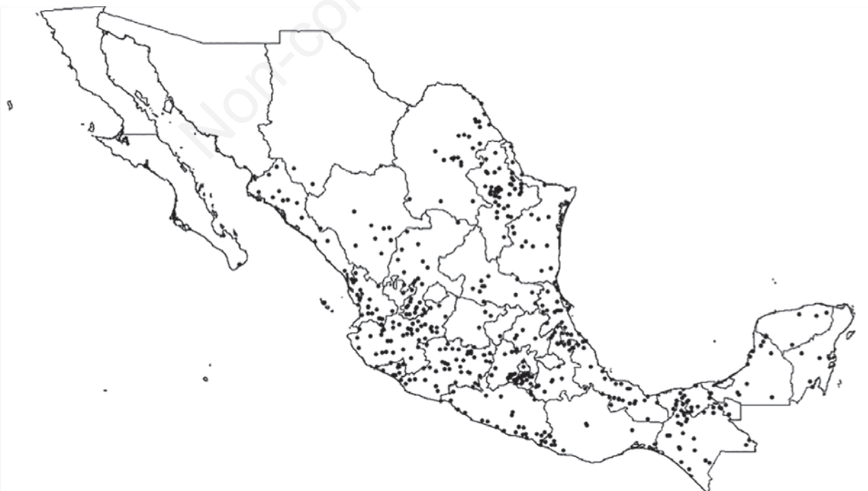
Figure 1. Rhipicephalus spp. occurrences in Mexico from 1970 to 2017.