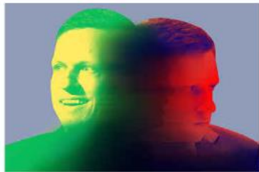
Peter Thiel Has Been Hedging His Bet On Donald Trump