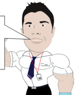
Figure 2: Posters in response to student feedback (produced by OU orderly)

A student responding to this initiative said,