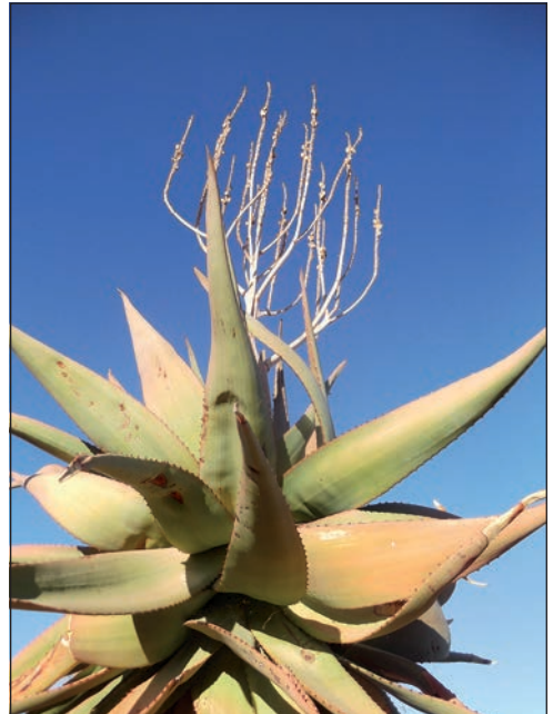
Fig. 2. Closer view of a rosette of A. littoralis .