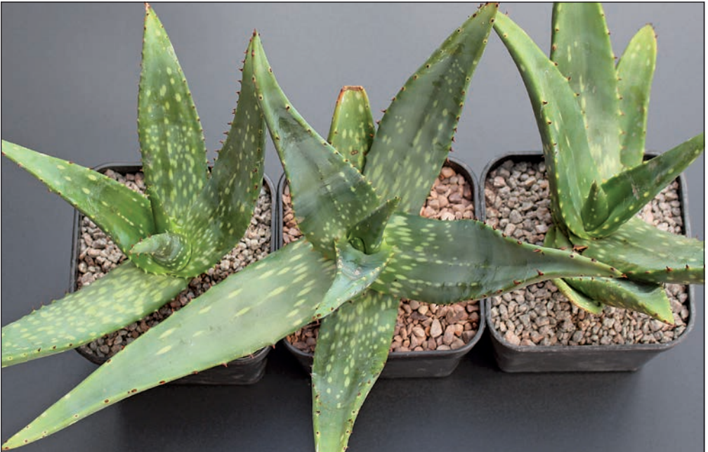
Fig. 3. Four year old seedlings of A. littoralis in the author's collection in 115 mm pots showing significant spotting of the leaves.

Janet was able to collect a small sample of seed from which a few seedlings were subsequently raised by another friend, Tina Wardhaugh (Fig. 3). The seedlings are robust, grow easily and as of September 2018 are just over four years old. Interestingly they all have heavily-spotted leaves with elongated pale spots. This feature of spotted juvenile leaves but unspotted mature leaves is not unique to this species as it has been observed in several other species, for example in A. tomentosa (Walker, 2016). Perhaps this spotted-leaved feature is related to camouflage of the juveniles to discourage herbivores from feeding on them?