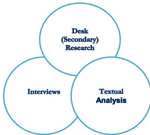
Fig. 2: Methodological Approach

As a strategy, the methodological practices add rigor, breadth, complexity, richness, and depth to the inquiry being explored throughout the research (Yin, 2009; Smith, 2010). The methods allow the research to focus on the film festival event, the participants' perspectives and the research themes. Within the context of the research, they allow for more comprehensive and reliable information without reliance on a single source and builds credibility for the research in a distinctive way (Yin, 2009; Baxter & Jack, 2008).