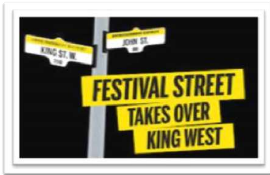
Image 8 - Festival Street, King St. W. and John St.