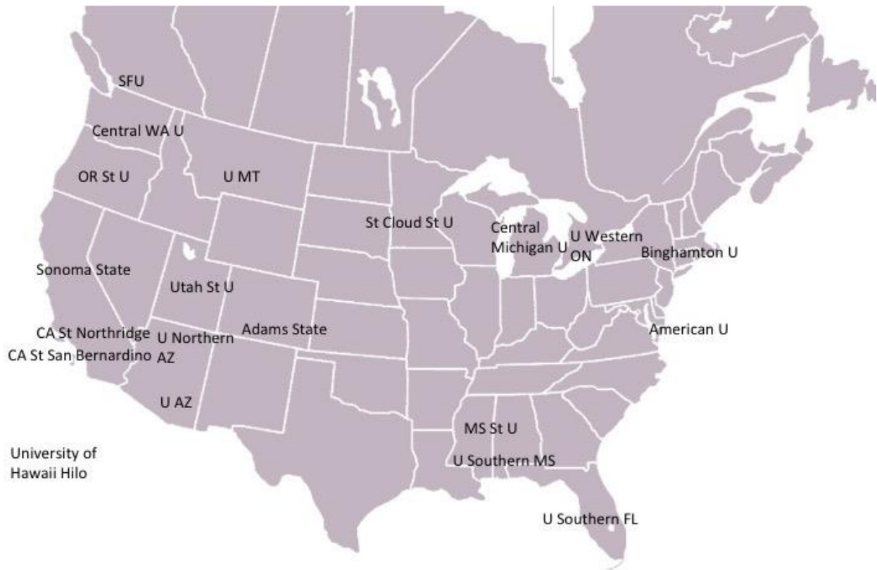
Figure 2. Universities in Canada and the United States that host HRM / CRM Master's programs with thesis requirements or options.