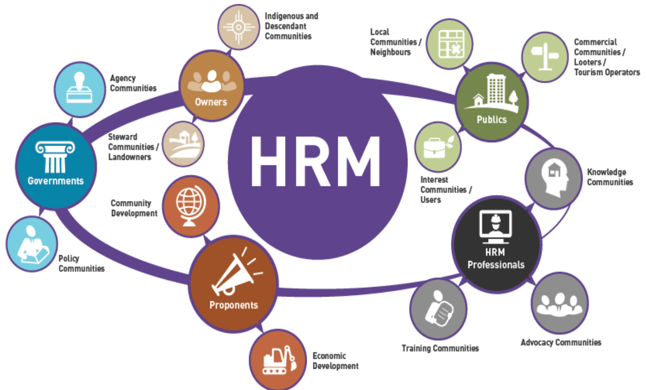
Figure 1. Five Principal HRM “Communities” or “Stakeholders” (graphic by Greg Holoboff).