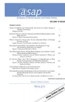
Analyses of Social Issues and Public Policy

IPSA's Research Committee on the Structure and Organization of Government (SOG) IPSA's Research Committee on the Structure and Organization of Government (SOG)