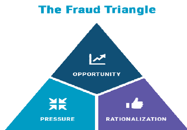
Figure 2. The fraud triangle (Source: Albrecht, (2014)).

The fraud triangle states that when there is perceived pressure, some perceived opportunity, and some way to rationalize the fraud as not being inconsistent with one’s values, fraud will be committed by an individual (Albrecht, 2014).