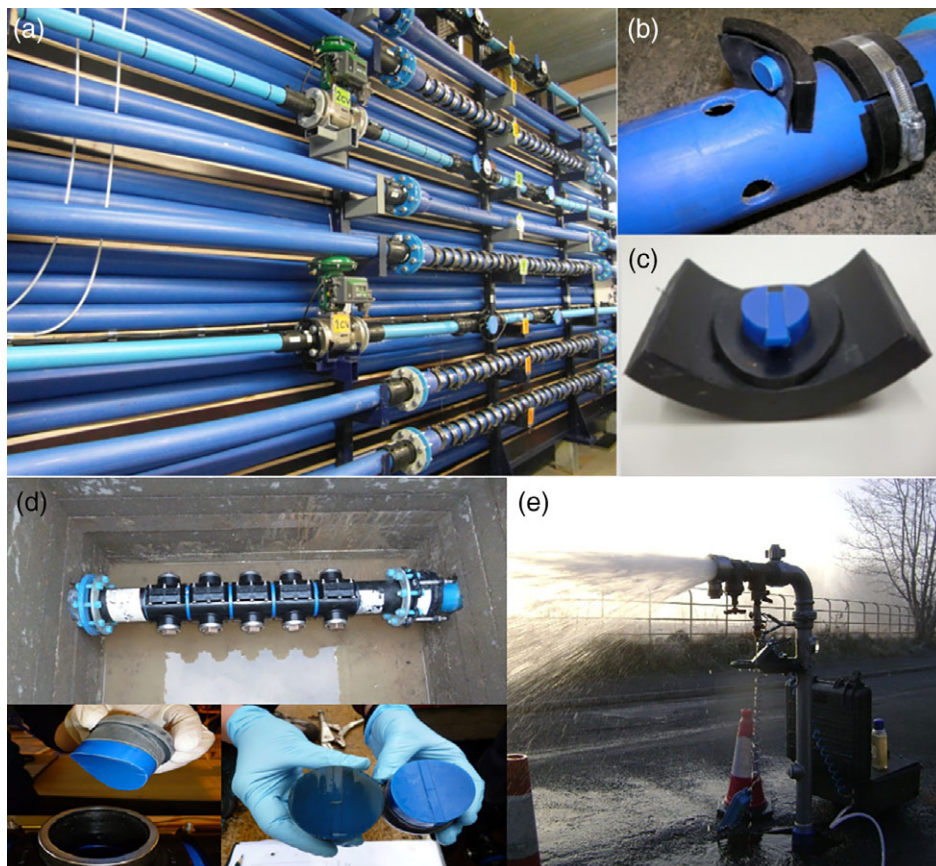
FIGURE 1 (a) Real-scale DWDS laboratory facility at Sheffield University, (b) PWG coupons are inserted along the pipe, (c) PWG coupons showing insert and outer part of the coupon. (d) Biofilm sampling devices used to sampling biofilm in situ during field work. (e) Flushing equipment used in real DWDS