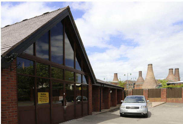
Fig. 3. Longton Spiritualist Church with the former Gladstone China Works (now Gladstone Pottery Museum) in the background, June 2015.

history of struggle and hardship; by reputation, the most working class city in England, a city known for what it used to make: pots (Fig. 3). Stepping into church is not a separation from those everyday concerns (see, also, Kong, 2001, 2010).