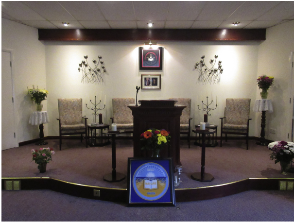
Fig. 2. Fenton spiritualist church, June 2017.