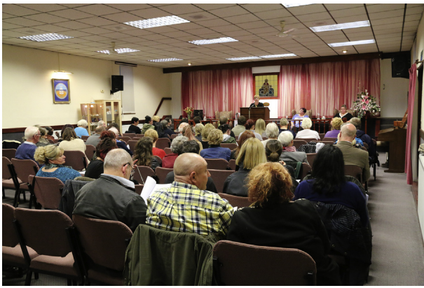
Fig. 1. Waiting for the service to begin, Burslem Spiritualist Church, June 2015.