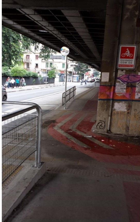
Figure 3: Poverty under the Minhocão.