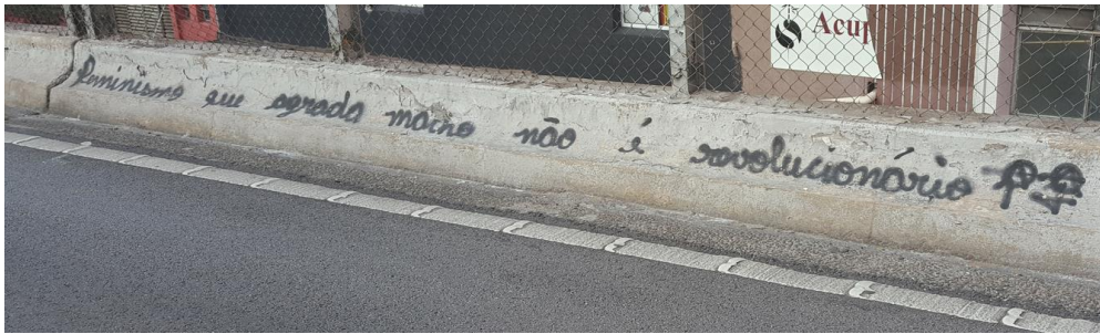
Figure 7: Largo Padre Péricles.