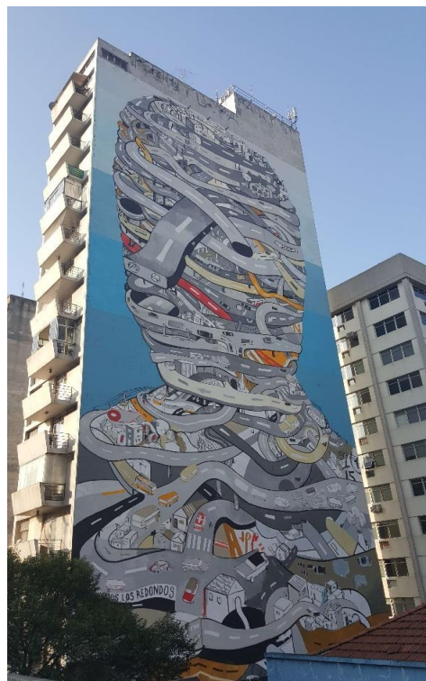
Figure 12: Underground city dwellers.