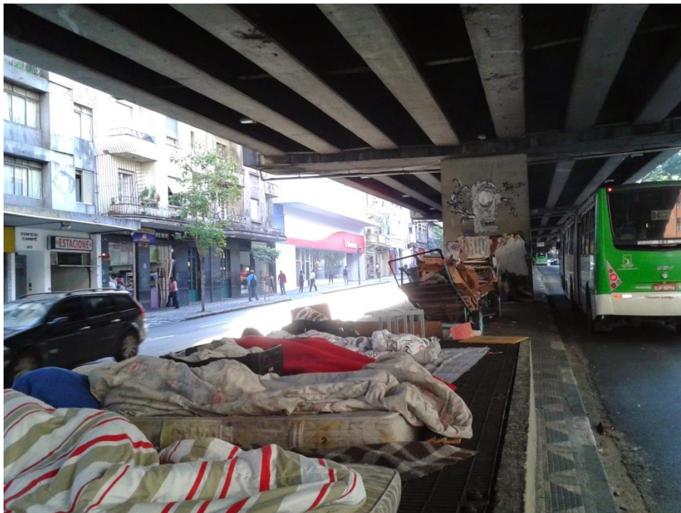
Figure 4: Minhocão as a social and economic space.