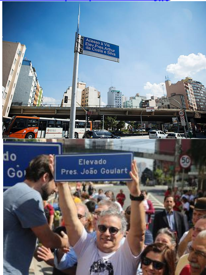
Figure 10: Analogizing the urban.