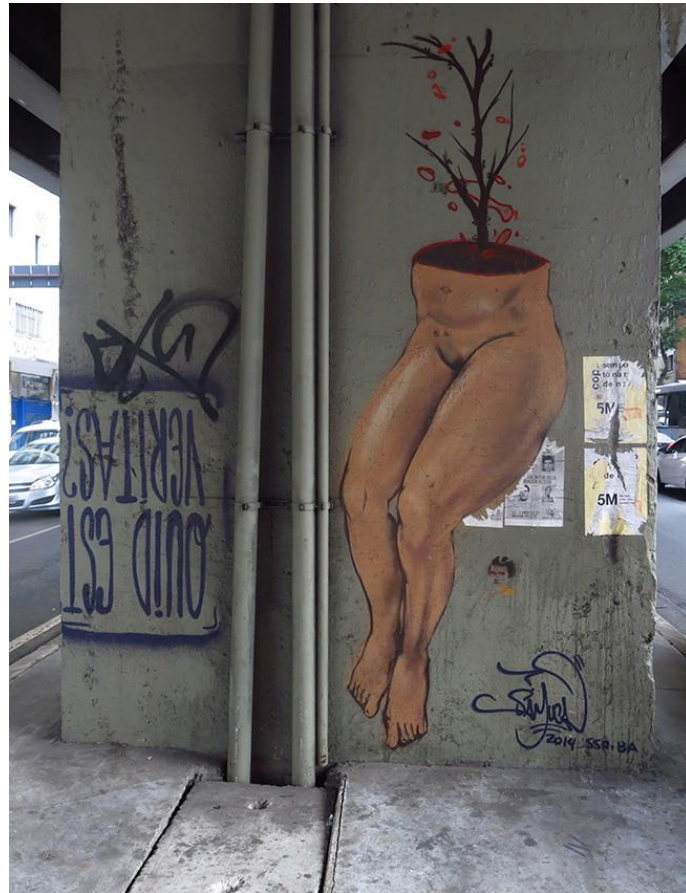
Figure 11: The city as confused mind.