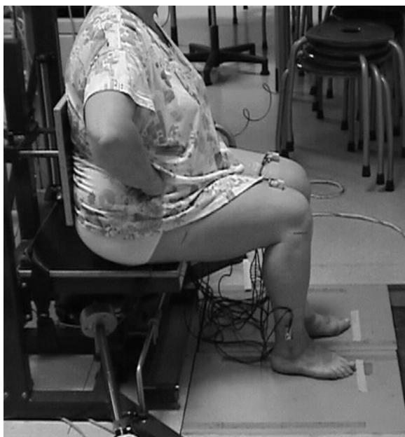
Figure 1. Experimental setup for the sit-to-stand movement.

earlier study. 36 In this earlier study, we calculated the optimal filter parameters necessary to process the accelerometer and gyroscope data. 36 The sampling frequency was set at 128 Hz. The loading asymmetry ratio was measured with 2 forceplates (sampling frequency=1,000 Hz), which were placed lengthwise next to each other so that both feet were on separate forceplates (Fig. 1). The loading symmetry ratio was defined as maximal peak vertical ground reaction force in the affected leg divided by the maximal peak vertical ground reaction force in the contralateral leg for the TKA group: