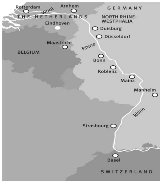
Fig. 4 Map Rhine river basin

The Working Group has mainly worked on joint research projects, e.g. on extreme levels of high water in the upper Rhine area (Lammersen 2004), and cross border risk