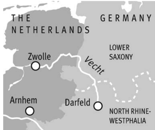
Fig. 3 Map river Vecht

Subsequently the WFD asked for a monitoring system that included chemical and biotic indicators. A working group of Dutch and German water managers addressed this issue for the relevant area. A Dutch and two dissimilar German federal guidelines for monitoring already pre-existed and had to be harmonised somehow. The working group discussed the differences and possibilities for cross-border calibration. To create completely identical systems proved impracticable due to the impact of German federal requirements. But calibrating the systems was possible and now German and Dutch data can be converted. This enables upstream water managers interpret downstream data in their own system and reversed.