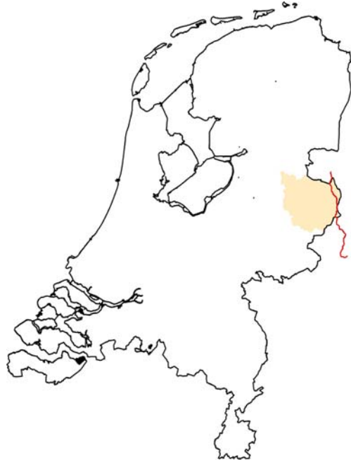
Fig. 2 Map river Dinkel