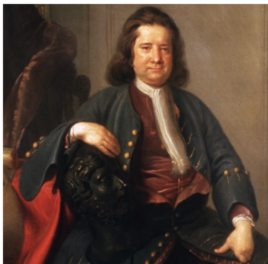
Fig. 1. Portrait of Humfrey Wanley by Thomas Hill, 1722.

the late 1600s. 4 And when two versions finally did appear — the Reverend Thomas Smith’s in 1696 and Humfrey Wanley’s in 1705 5 — they represented the fruits of bibliographic labours undertaken with great care and anxiety over the individual mastery of a sumum of texts delimited by the contingencies (social, political, economic, geographical, and otherwise) of time and place, as well as over the perceived importance of indexing and preserving a national literary heritage well before the academic disciplines of systematic bibliography, literary history or English studies even existed. 6 What follows is an examination of those labours and anxieties — anxieties that stemmed, partly, from the belief, as Wanley himself once put it, that ‘the catalogue is the life of a declaration [sic] of what is contained in a library, 7 ’ and also from the fact that the early modern cataloguer often worked with very little sustained patronage or institutional support.