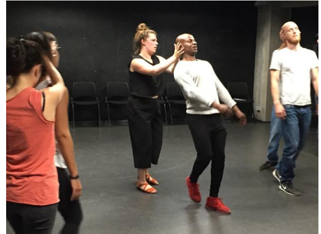
Figure 4: In Condition 3, participants were led in a half-hour session of contact improvisation, an experimental dance technique where human dancers experiment with motion and balance.

We worked with a combination of quantitative and qualitative methods that captured the individual experiences of study participants. This included a team of video researchers and the development of a subjective, self-assessment measurement inspired by the Functional Movement Screen (Cook 2006). Together, these assessment tools provide methods for analyzing the conditions of the experimental set up as well as the qualitative experience of the participants. In the next section we describe the key aspects of these tools, and outline their potential for further development.