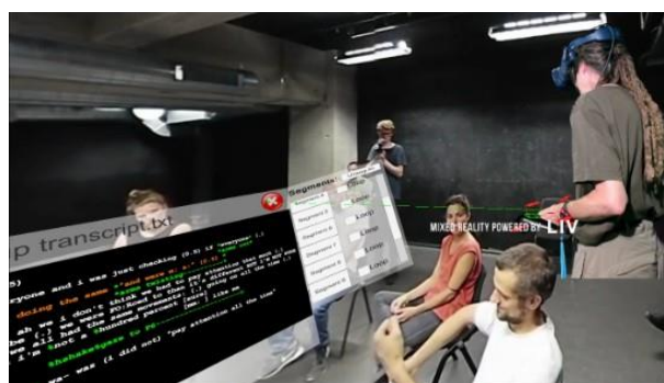
Figure 7: A screenshot of the virtual researcher working with a transcript of talk in the Condition 3 focus group in which a subject (below) re-enacts his shared embodied experience with the exoskeleton.