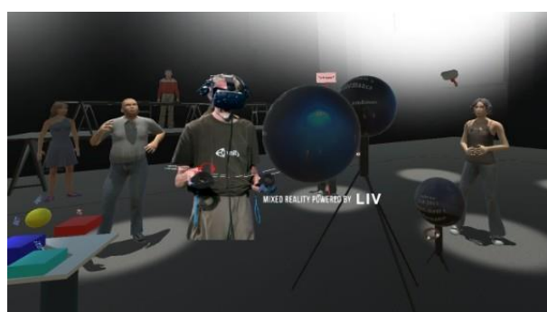
Figure 6: A screenshot of the virtual researcher walking through and manipulating the 3D reconstruction of the experiment, which includes avatars, the virtual camera locations and actual 360-degree video footage (spheres).