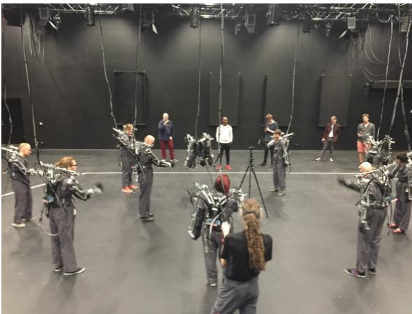
Figure 3: The experiments were conducted in a theatre and simulated a laboratory scenario. A team of researchers recorded the trials, which included dressing, a set of choreography lasting eight minutes, and a follow up focus group interview.

We worked with a combination of quantitative and qualitative methods that captured the individual experiences of study participants. This included a team of video researchers and the development of a subjective, self-assessment measurement inspired by the Functional Movement Screen (Cook 2006). Together, these assessment tools provide methods for analyzing the conditions of the experimental set up as well as the qualitative experience of the participants. In the next section we describe the key aspects of these tools, and outline their potential for further development.