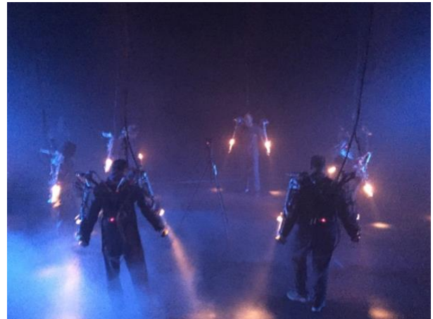
Figure 1: Inferno (Louis-Philippe Demers and Bill Vorn) is an interactive dance performance where audiences perform wearing tele-operated upper body exoskeletons.

When touring the performance, Demers and Vorn observed literally hundreds of novices learning to move in harmony with exoskeletons. For each performance, the artists observed a detectable moment when audiences would "give over to the machine." According to Demers, this signalled the moment when participants begin working with the prescribed motions instead of against them. The artists were interested in finding out more about what precisely was happening at that moment, and whether this shift could be detected through documentation or movement analysis.